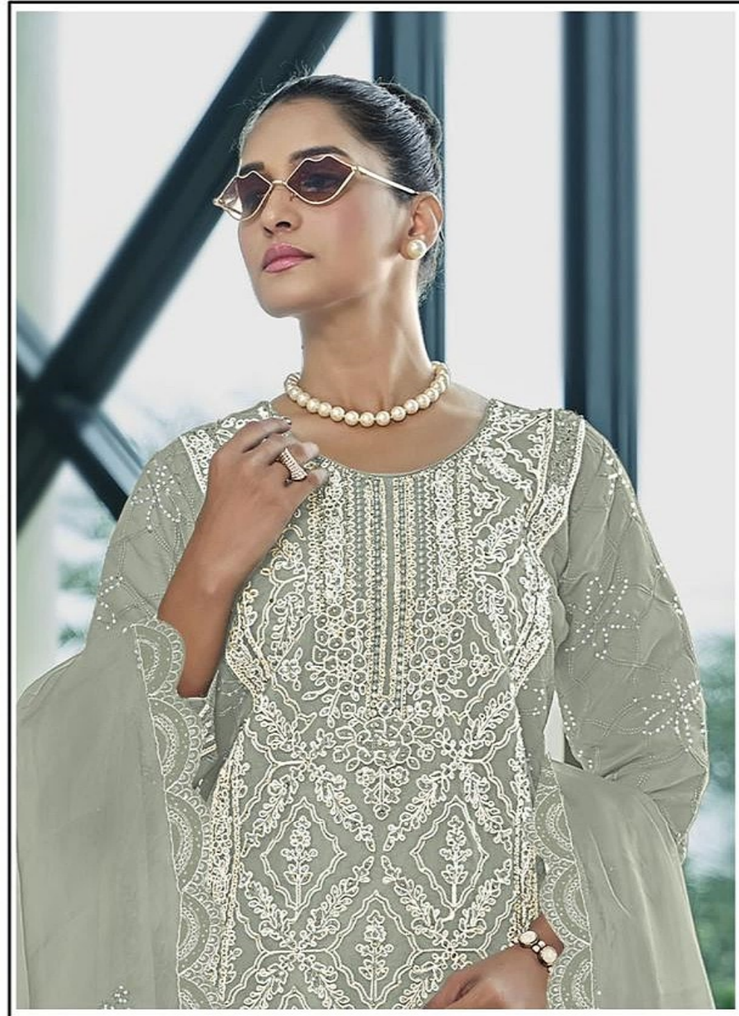
TOP Orange Kedding Embroidered With Japer