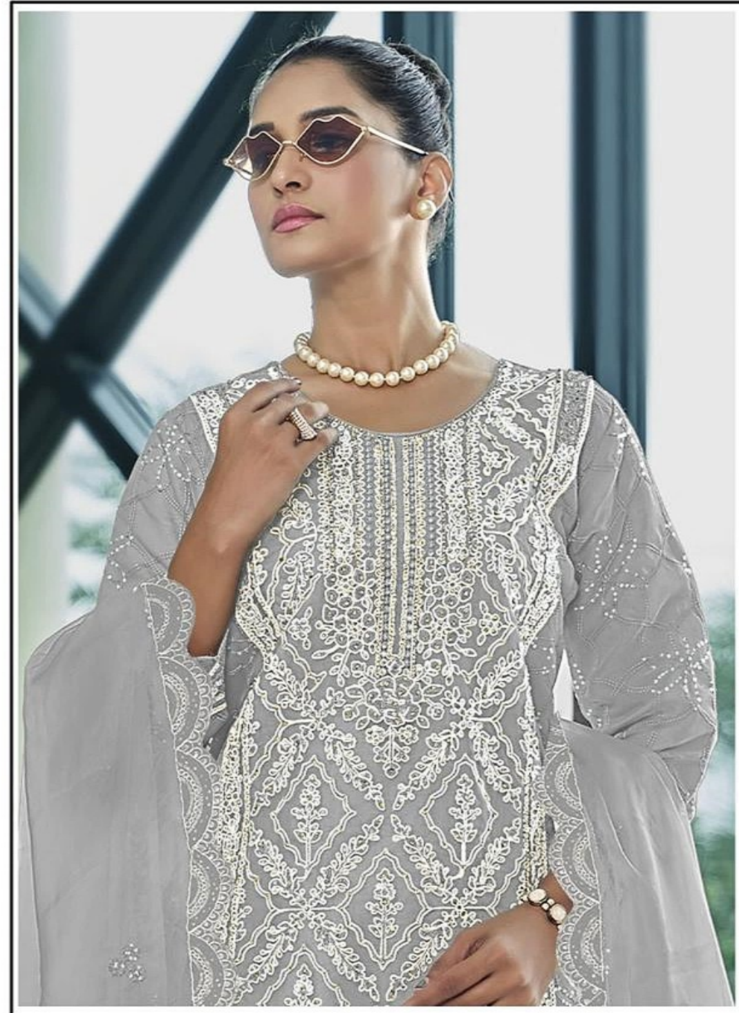
TOP Orange Keddin Embroidered With Japer