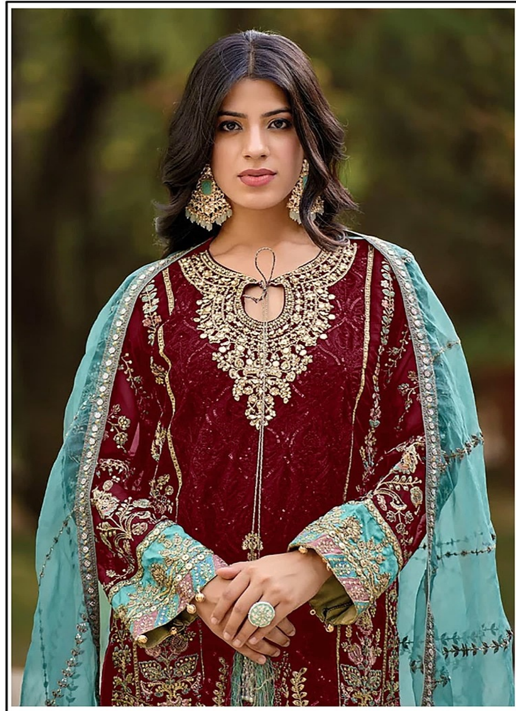
TOP Heavy Fov Georgette With Embroidery Work