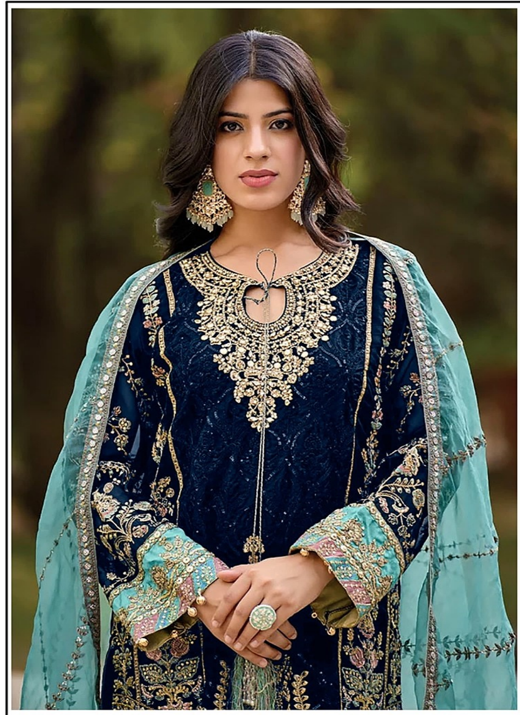
TOP Heavy Foy Georgette With Embroidery Work