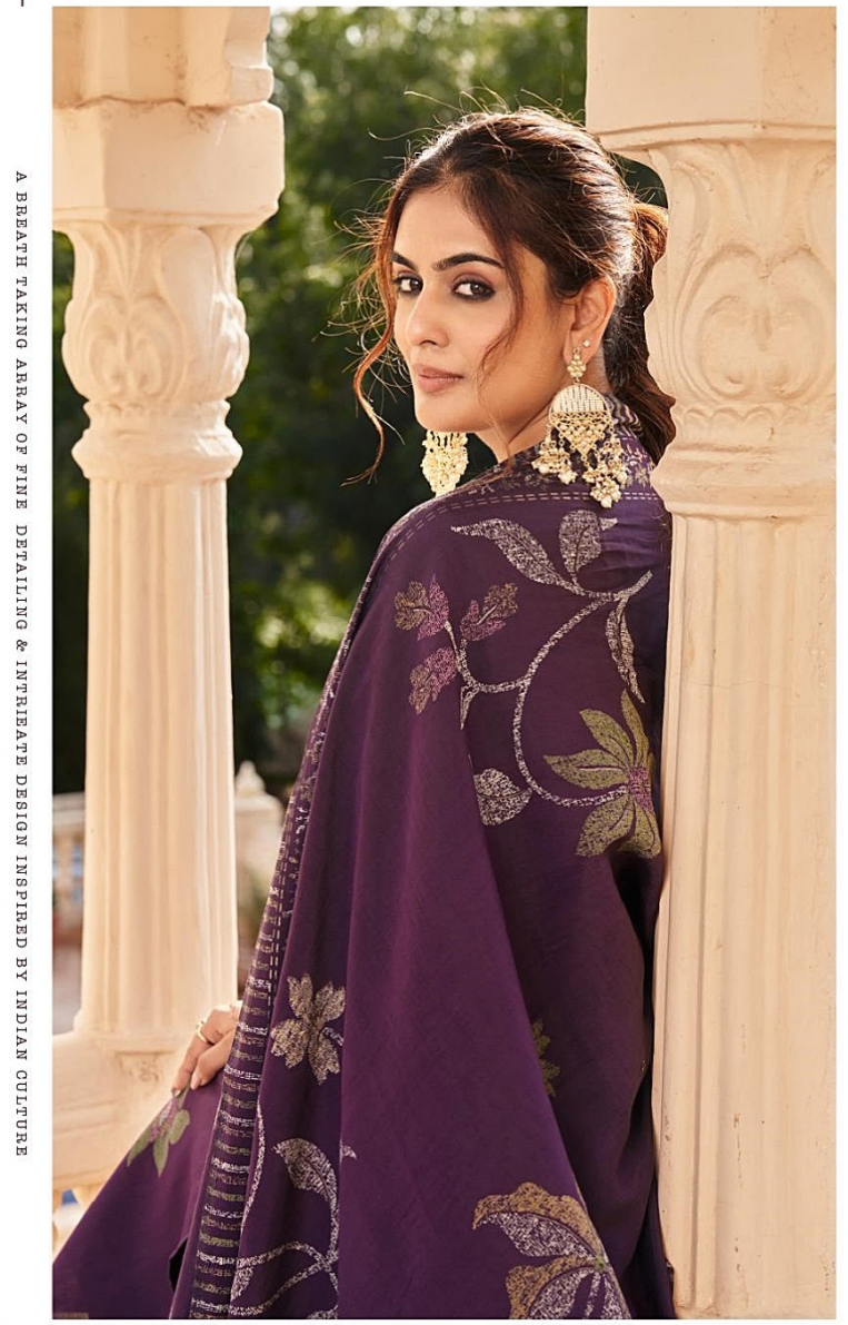
A BREATHTAKING ARRAY OF FINE DETAILING & INTRICATE DESIGN INSPIRED BY INDIAN CULTURE