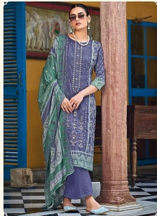
CODE # 2007