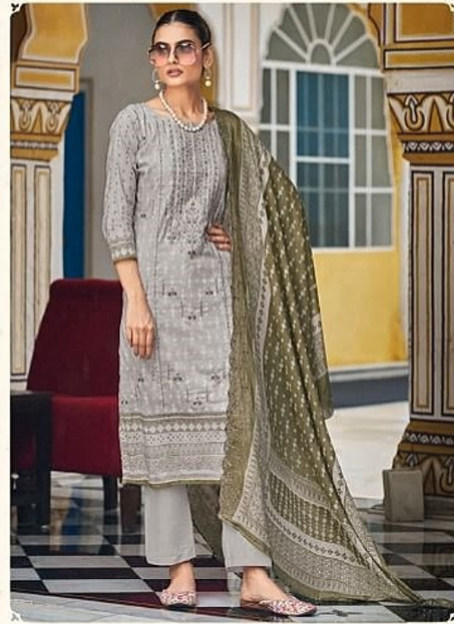
CODE # 2005