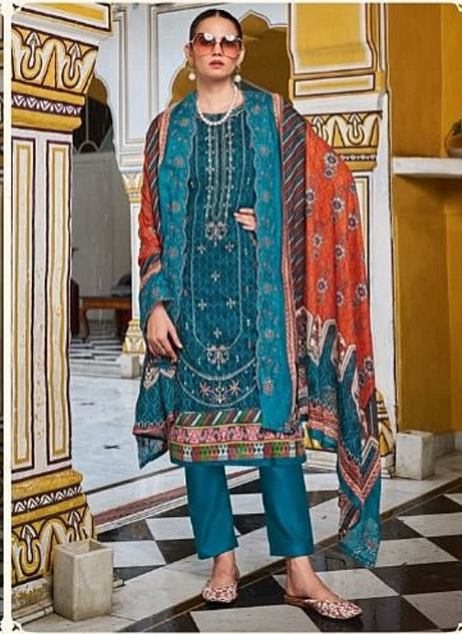
CODE # 2006