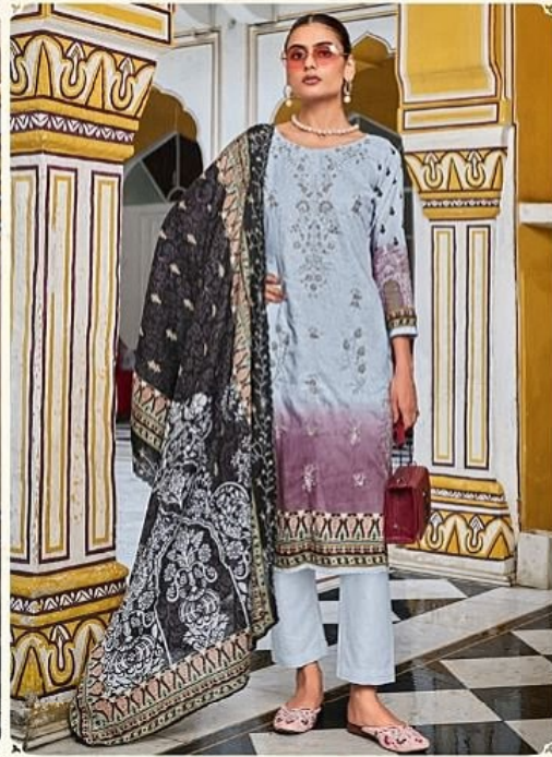
CODE # 2002