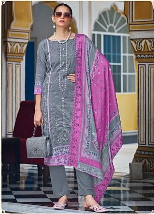
CODE # 2001