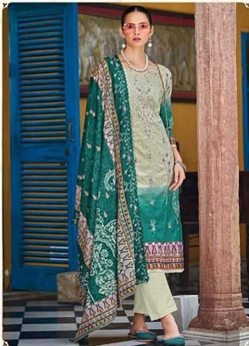
CODE # 2003