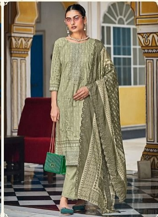
CODE # 2008