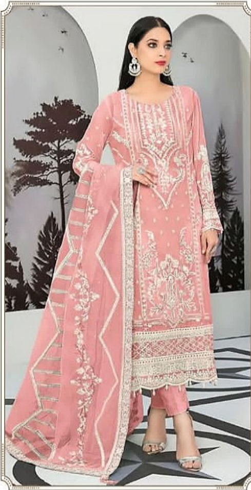
D 2018 A