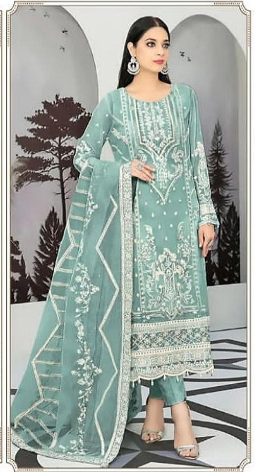
D 2018 D