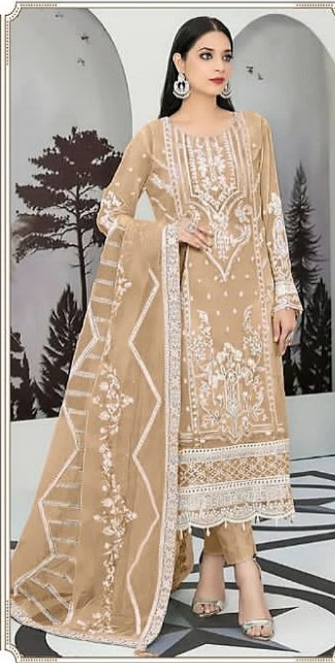
D 2018 C