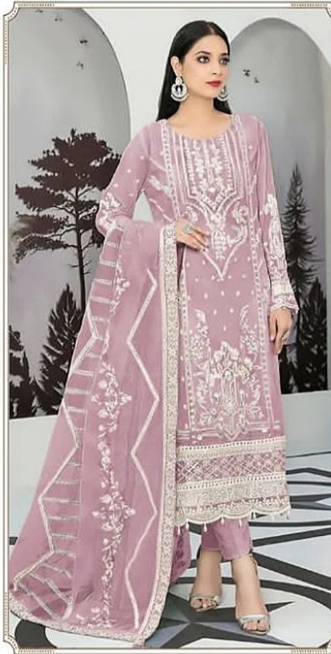
D 2018 B