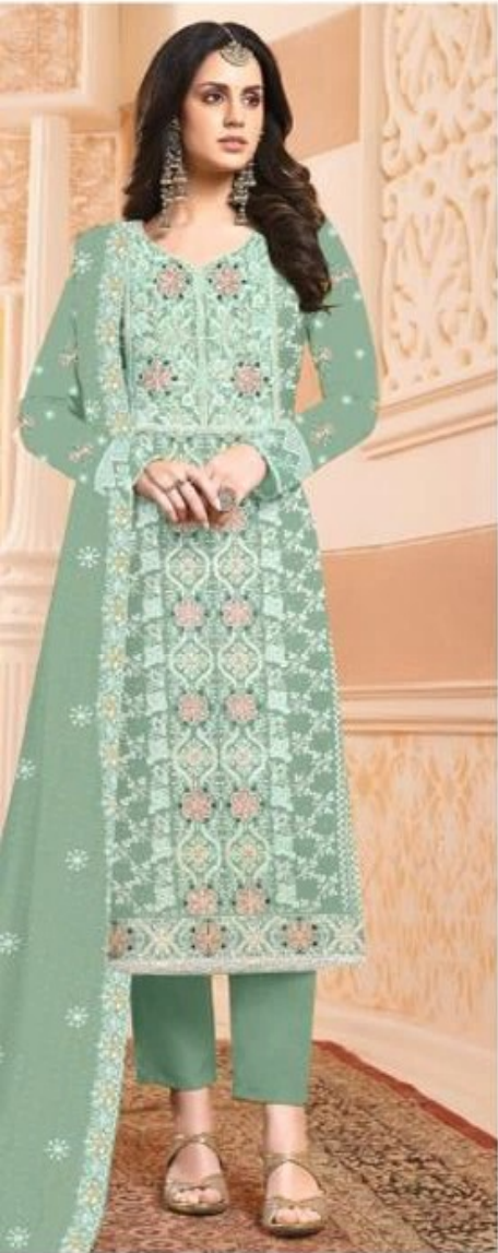
D.NO- 212 A