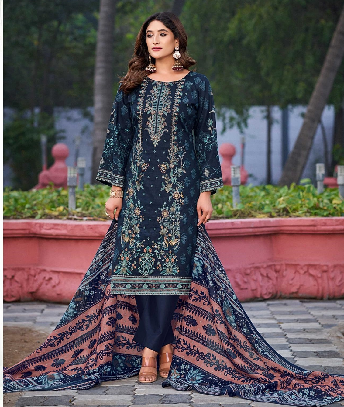
"Nature's Art in Ethnic Style" From ethnic roots to modern charm, Feel the culture, warm and calm.