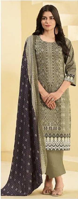
STYLE NO. | 7030