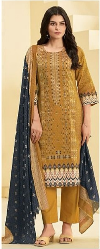
STYLE NO. | 7029