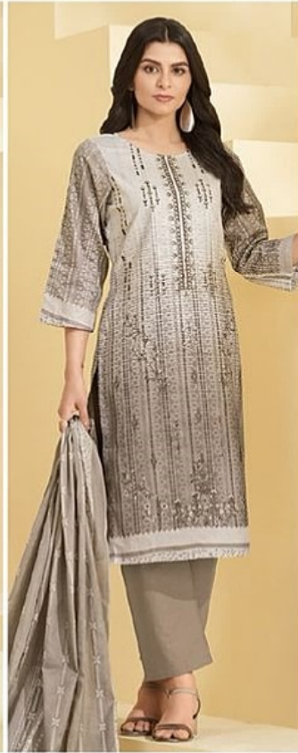
STYLE NO. | 7031