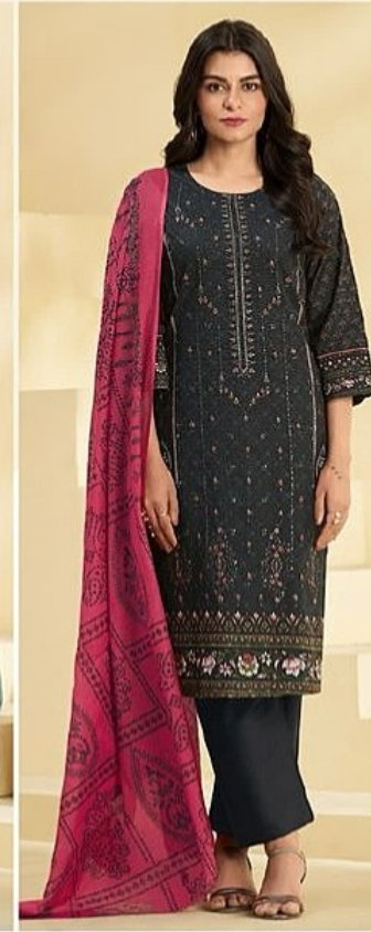
STYLE NO. | 7033