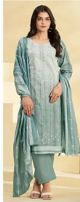
STYLE NO. | 7032