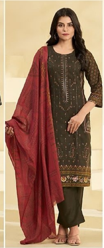
STYLE NO. | 7034