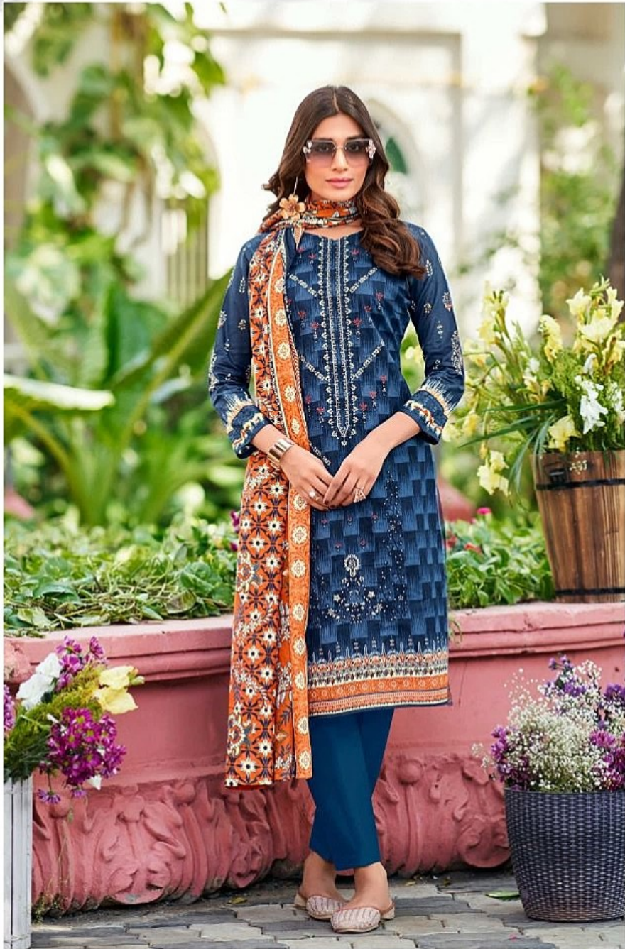
"A Collection Rooted in India's Rich Culture."