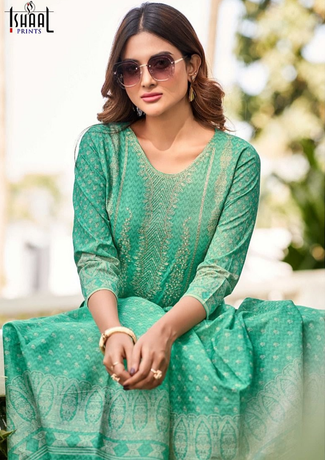
"The Art of Ethnicity, The Beauty of Nature."