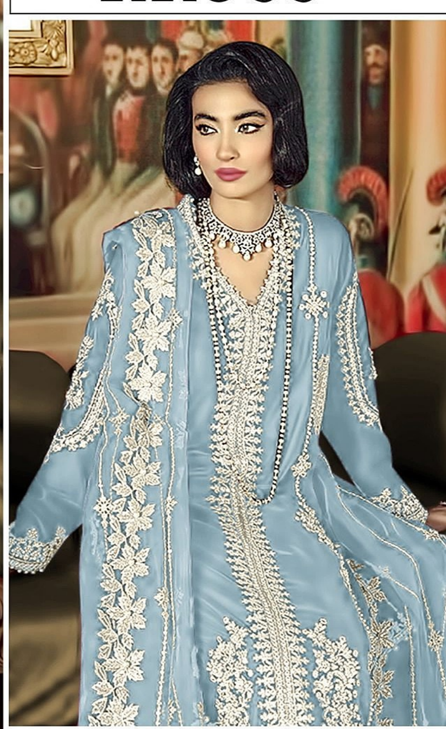
TOP:- ORGANZA EMBROIDERED