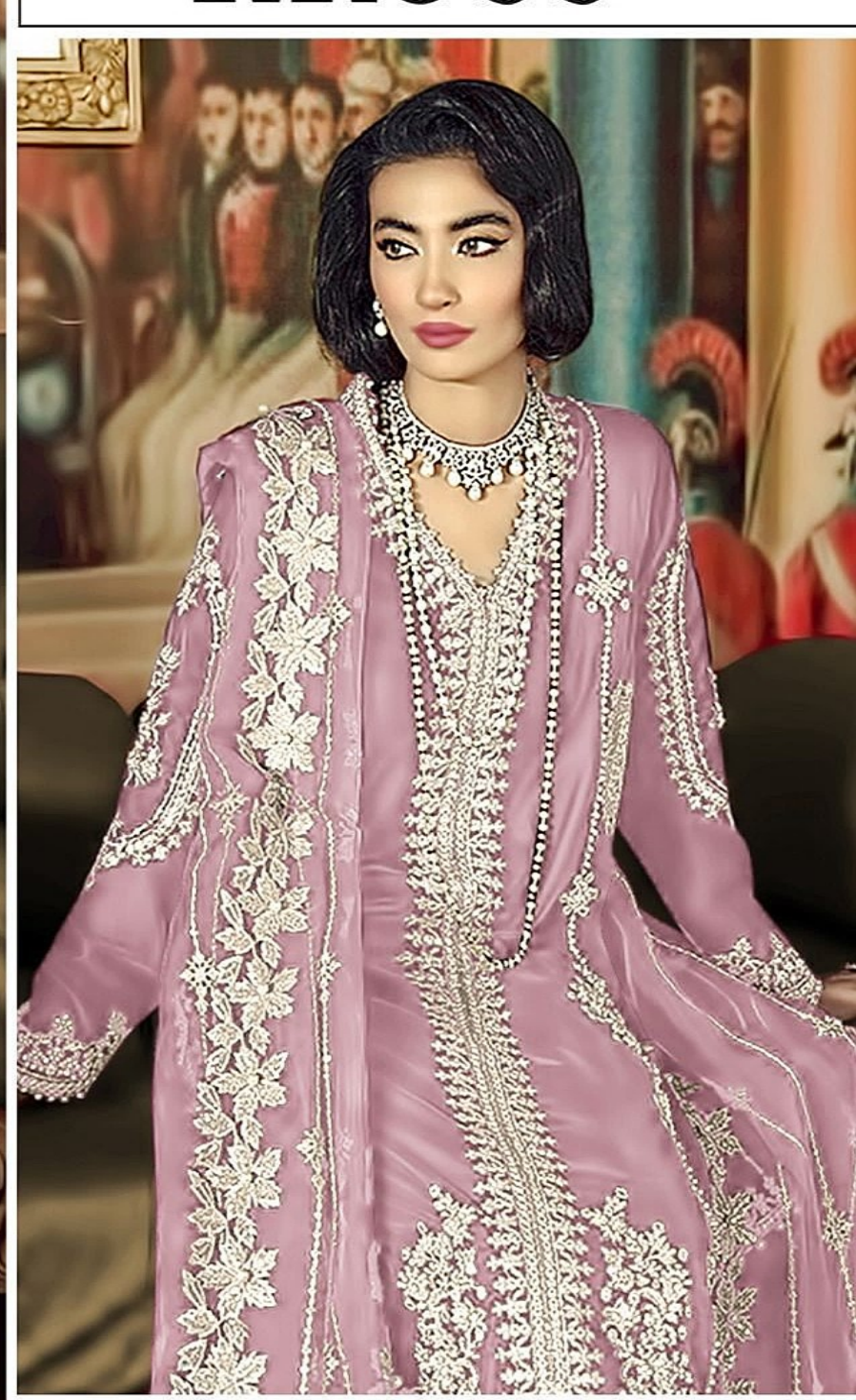
TOP:- ORGANZA EMBROIDERED