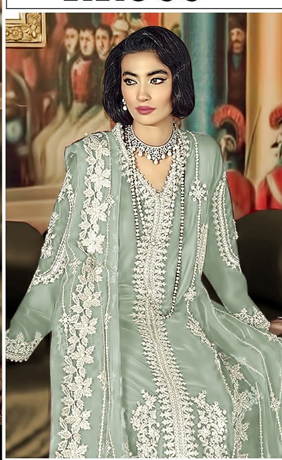
TOP:- ORGANZA EMBROIDERED