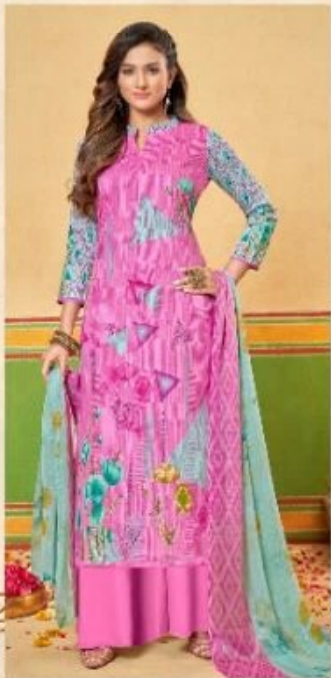
••• S- 965-005 •••