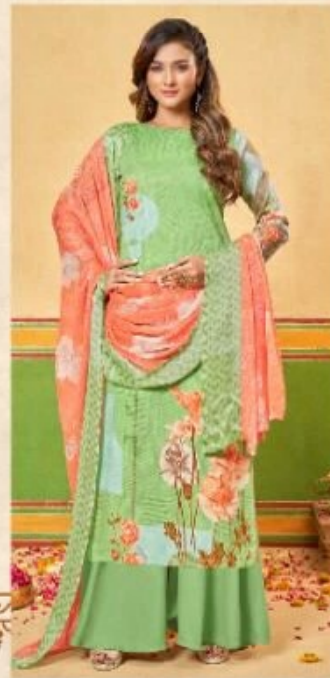
••• S- 965-008 •••