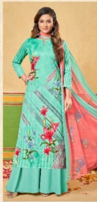
••• S- 965-003 •••