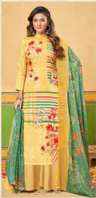
••• S- 965-001 •••