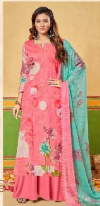
••• S- 965-007 •••