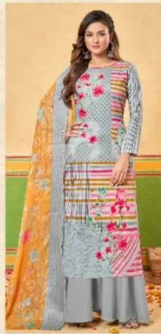
••• S- 965-004 •••