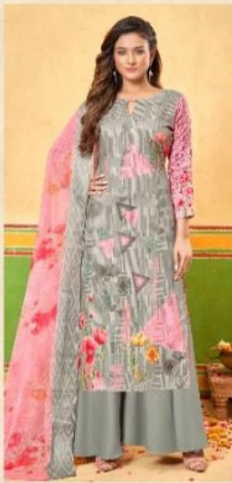
••• S- 965-002 •••