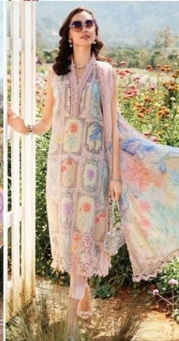
D NO 17004