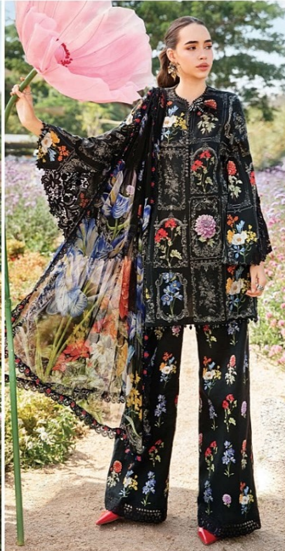
D NO 17002