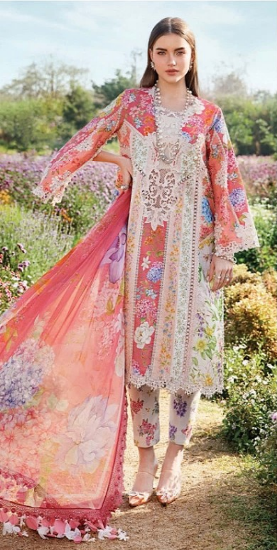
D NO 17001