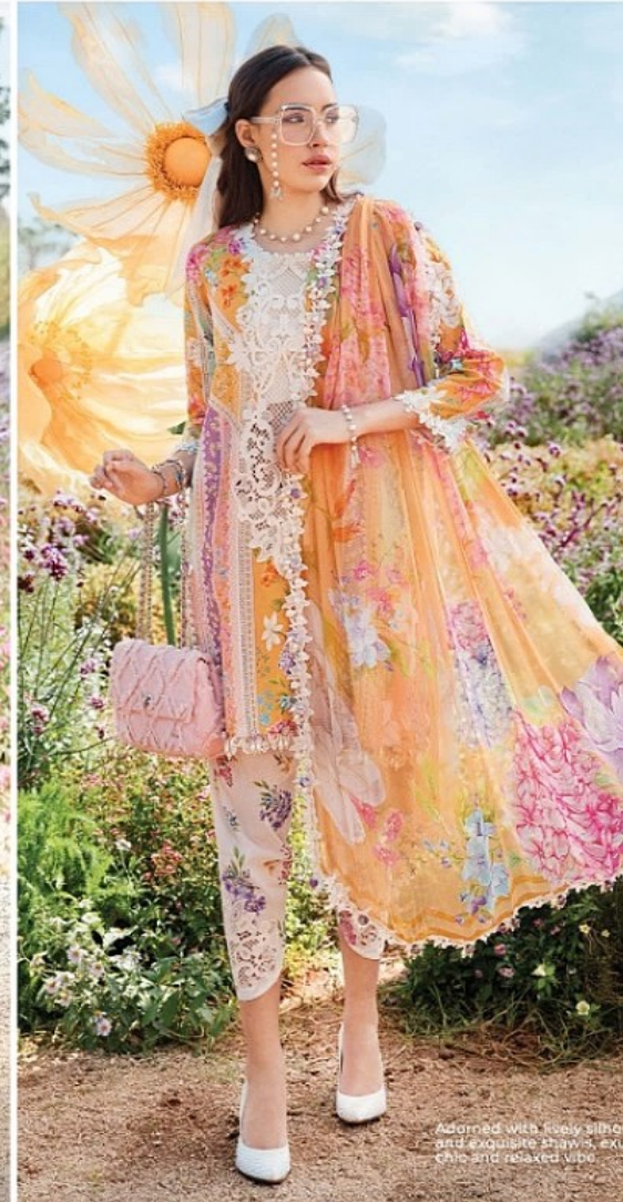
D NO 17003