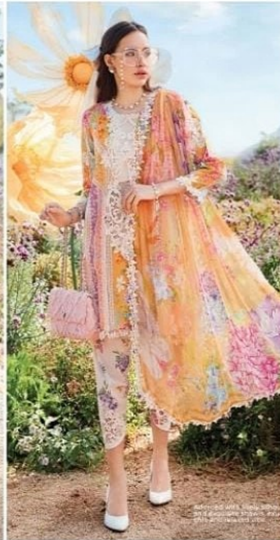
D NO 17003