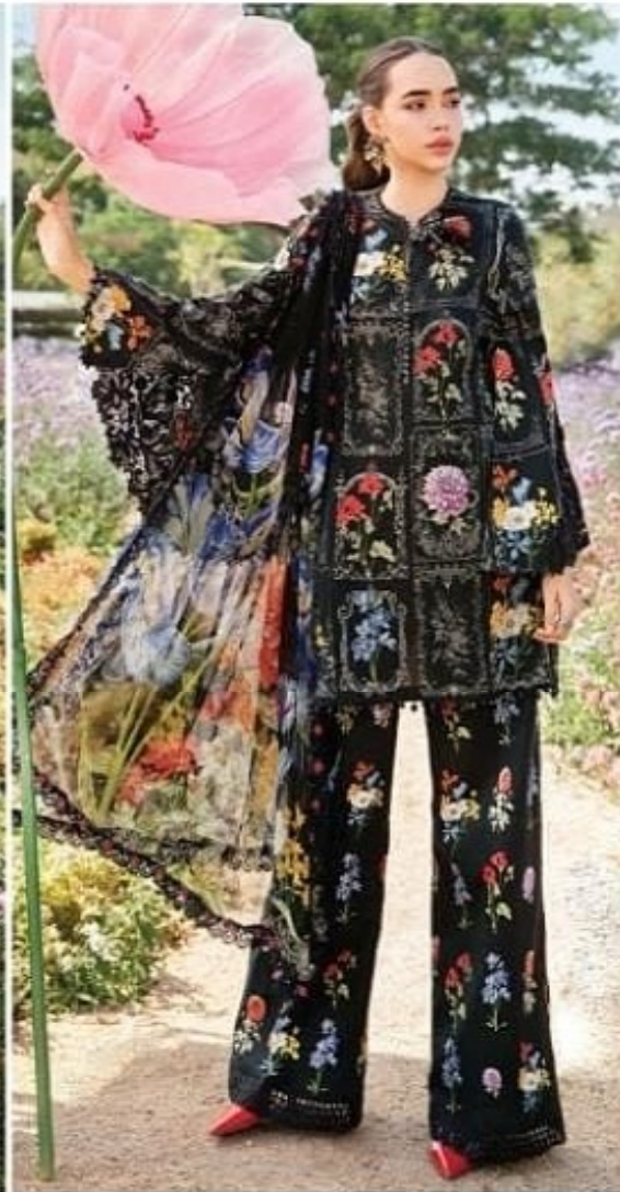
D NO 17002