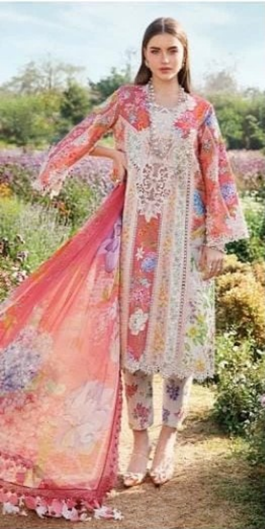
D NO 17001