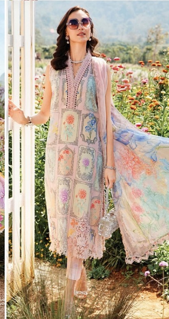
D NO 17004

Adorned with easy silhouette and exquisite drape, exuding chic and relaxed vibe.