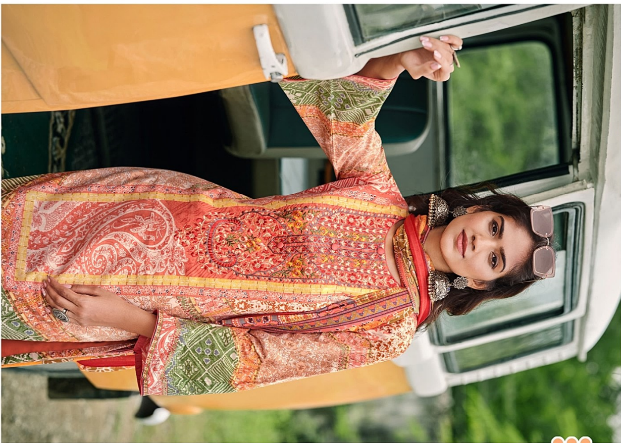
Unconventional designer saree for which you'll surely love to fall!