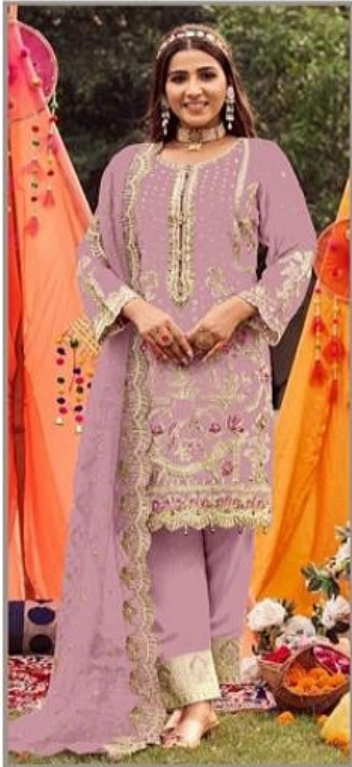
D.NO.III U 1

TOP - ORGANZA SILK BOTTOM / HEAVY SHANTUN DUPATTA - ORGANZA SILK