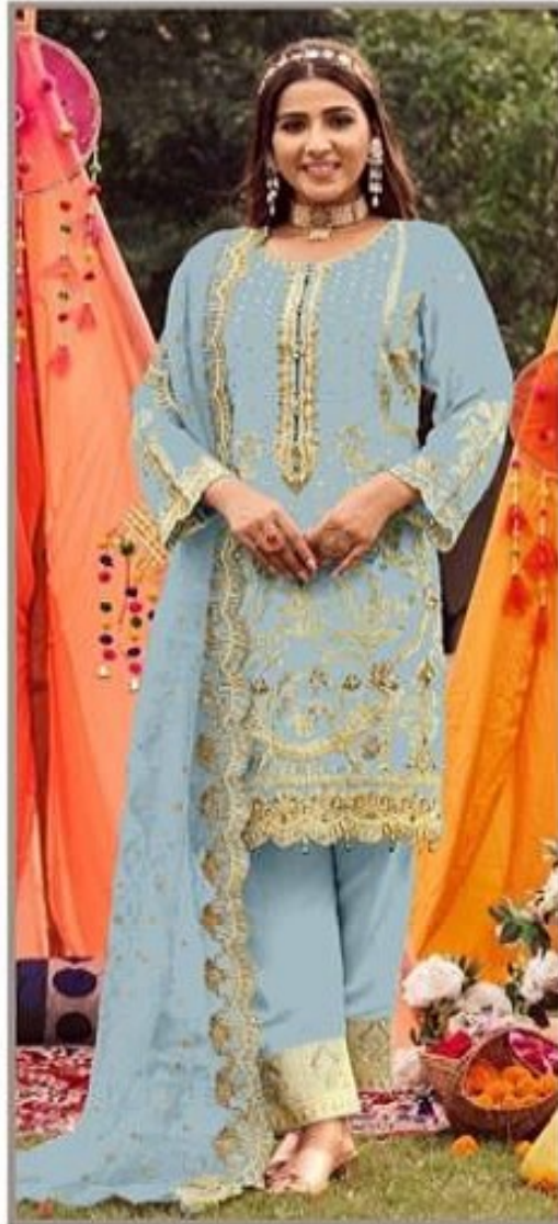
D.NO.III V 1