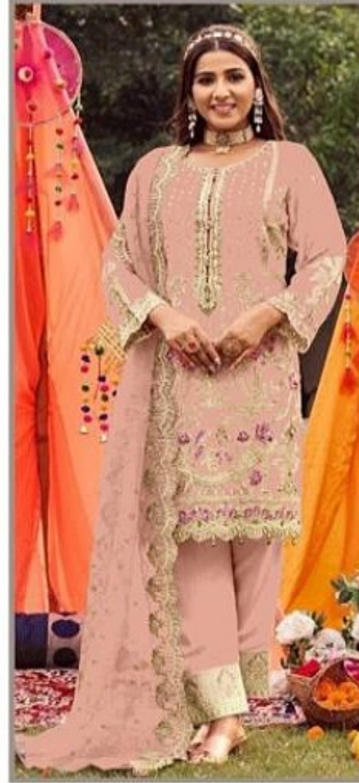
D.NO.III W 1