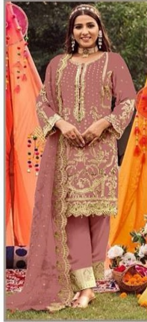
D.NO.III C 3