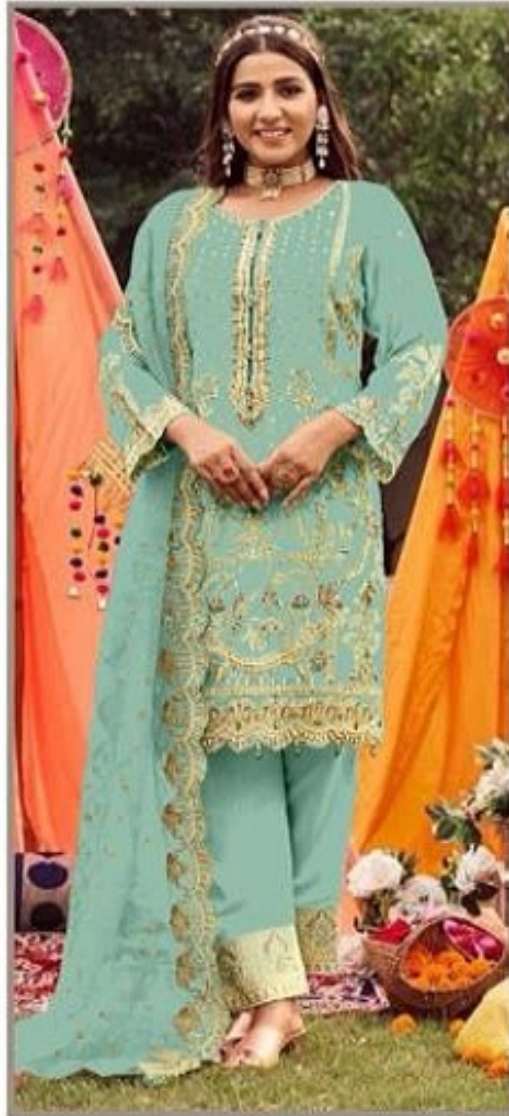
D.NO.III B 3