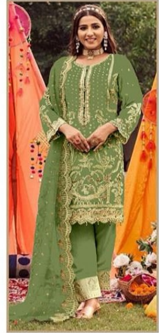
D.NO.III D 3