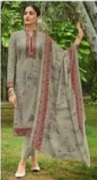
---NUR | 2001---