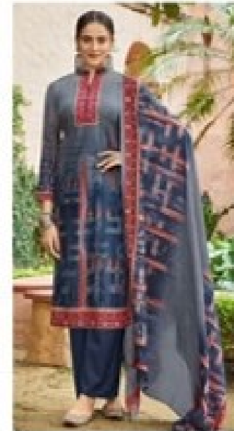
---NUR | 2008---