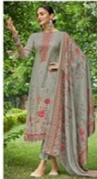
---NUR | 2003---