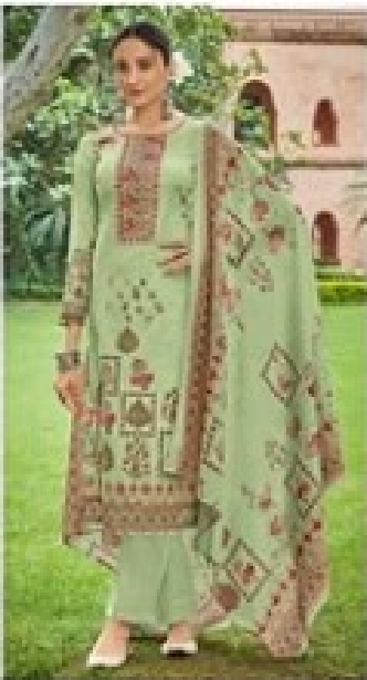
---NUR | 2004---