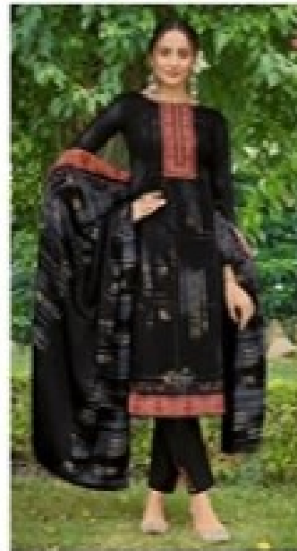
---NUR | 2006---