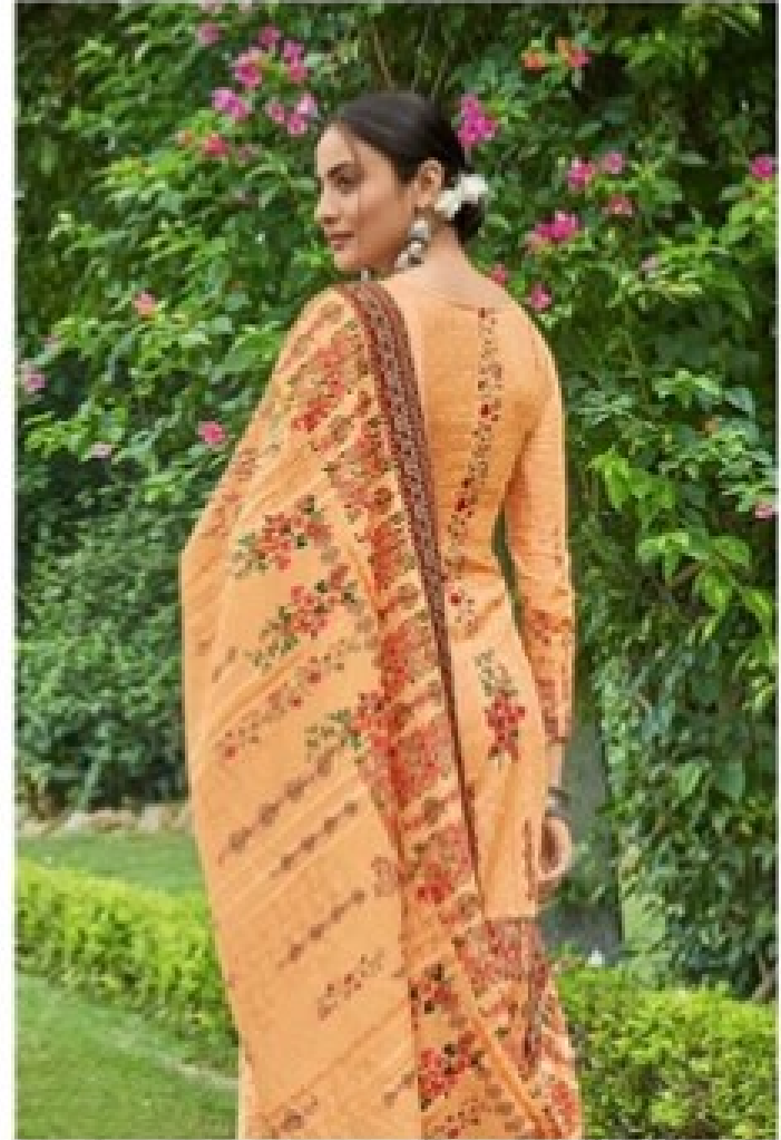
--- NUR | 2002 ---