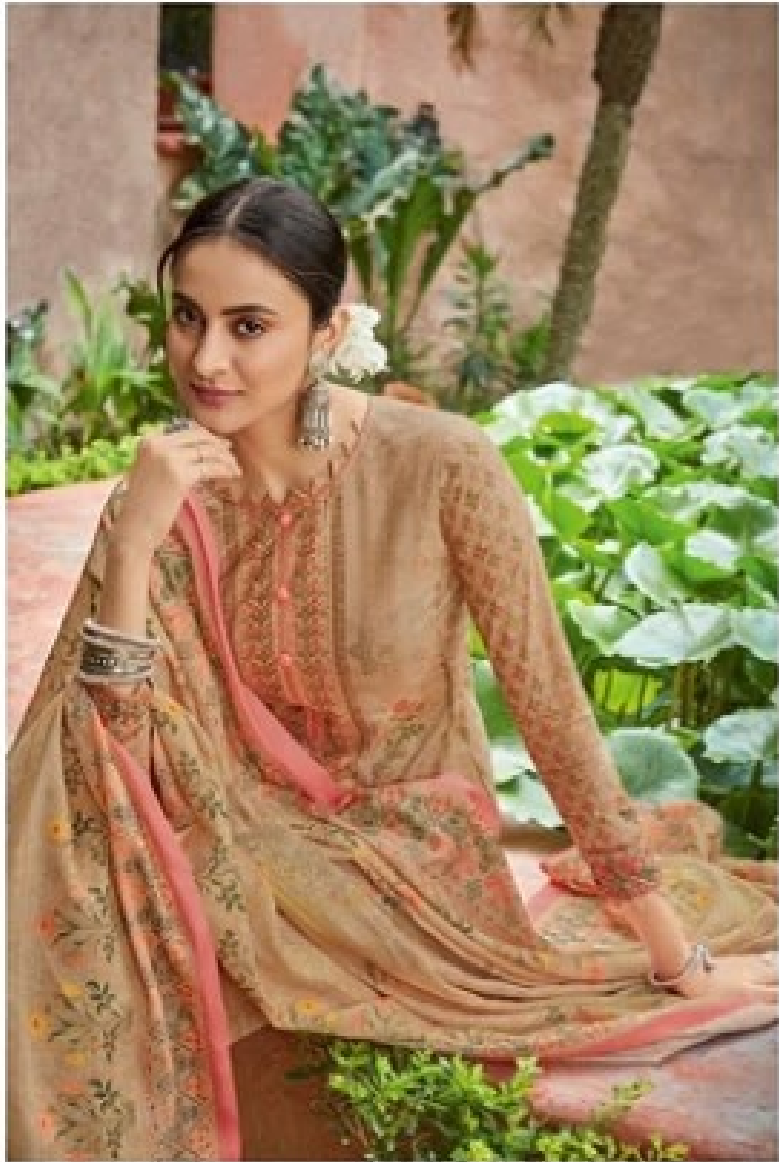
--- NUR | 2007 ---