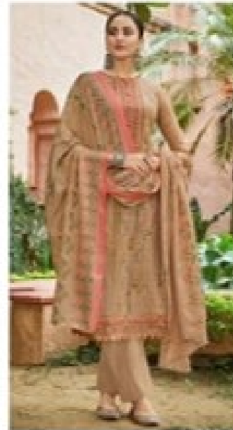
---NUR | 2007---