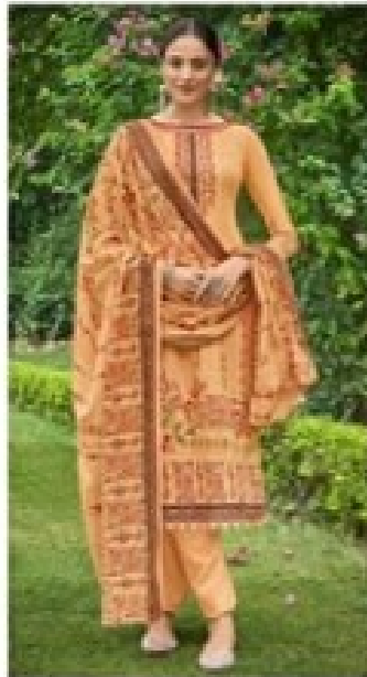
---NUR | 2002---