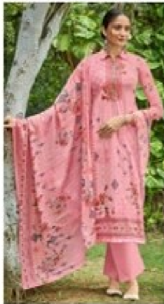
---NUR | 2005---