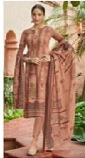
---NUR | 2010---

حوس لائون HOUSE OF LAWN® DEFINING FEMININITY AND LUXURY