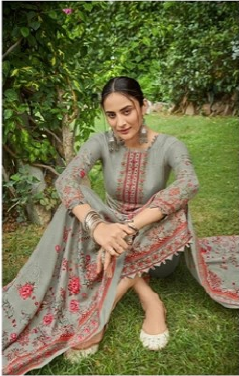
...NUR | 2003...