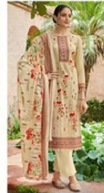
---NUR | 2009---