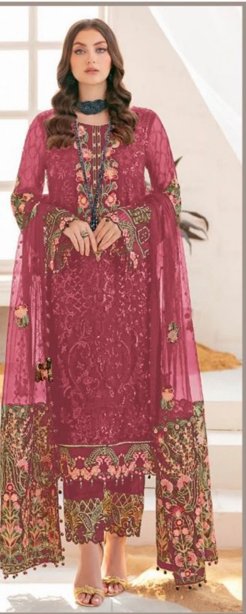
D.NO.53002 A 4