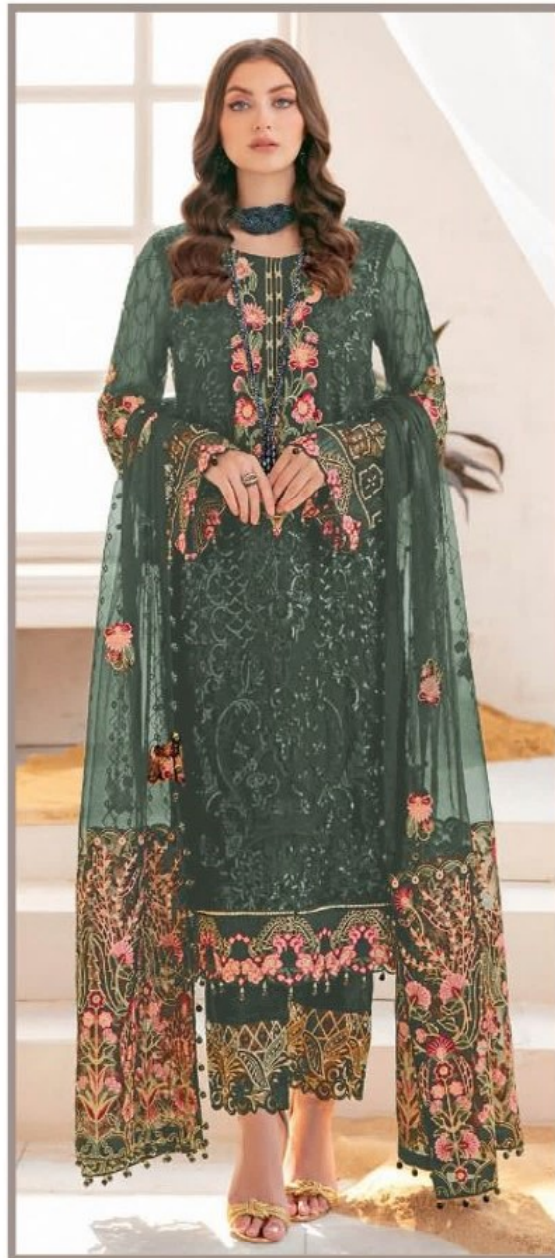
D.NO.53002 B 4