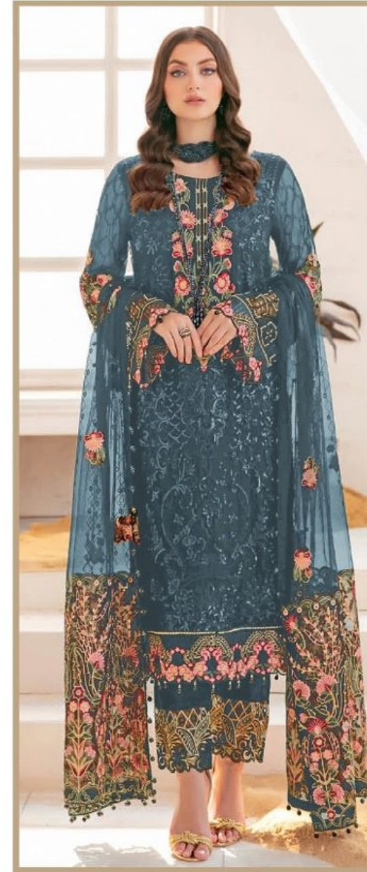
D.NO.53002 D 4