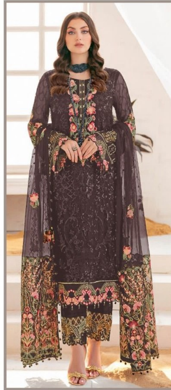
D.NO.53002 C 4