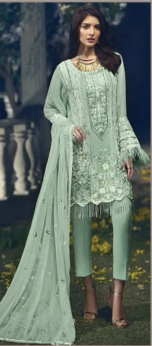
D.NO.1374 A 6

TOP - FOX GEORGETTE WITH HEAVY EMBROIDERY & HANDWORK BOTTOM & INNER - HEAVY SHANTUN DUPATTA - NAZIN WITH HEAVY EMBROIDERY