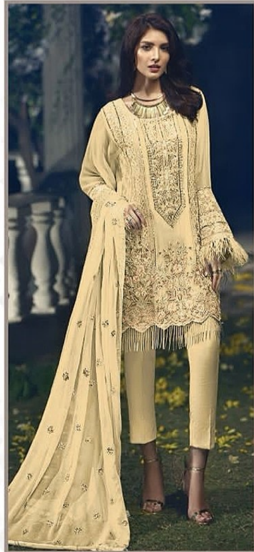
D.NO.1374 B 6