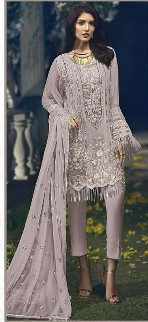
D.NO.1374 C 6