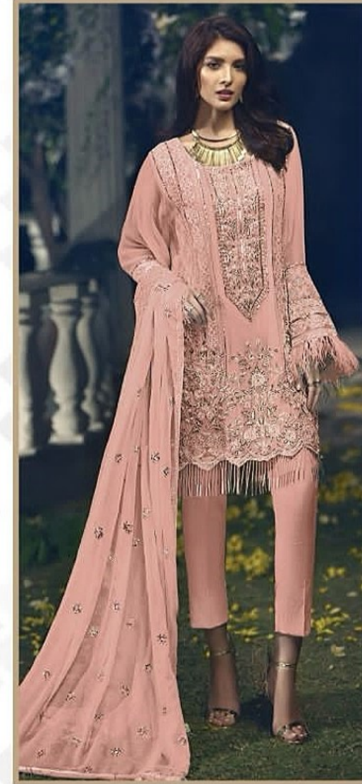
D.NO.1374 D 6