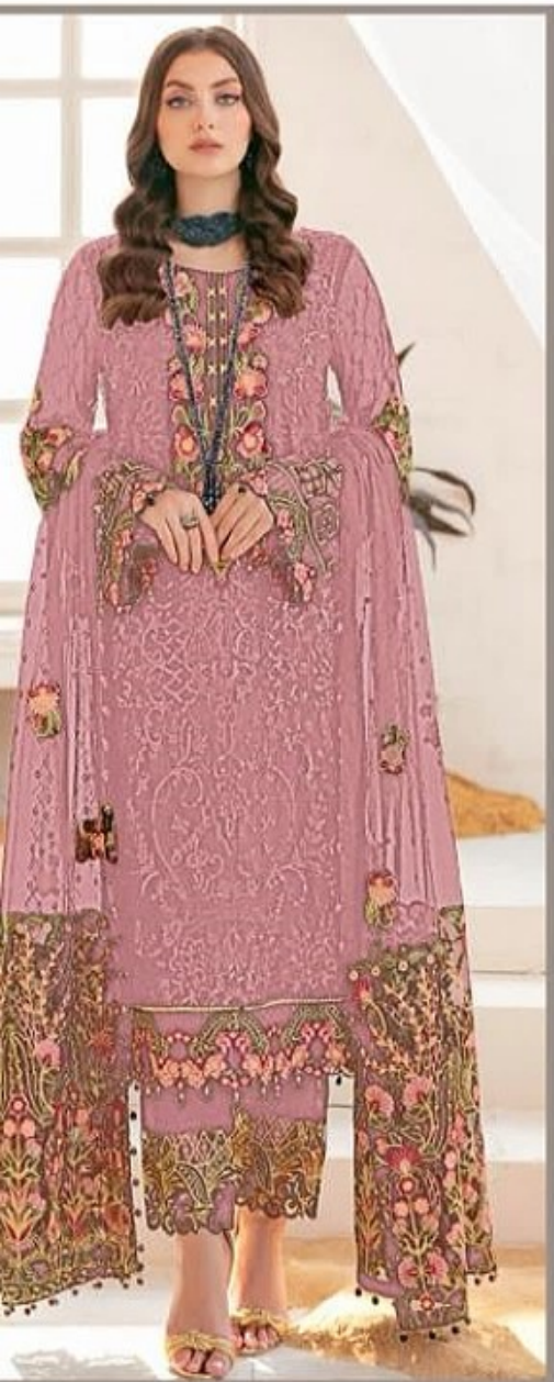
D.NO.53002 A 7