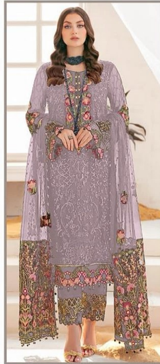
D.NO.53002 C 7