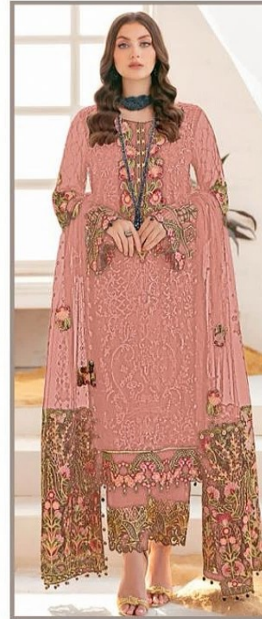
D.NO.53002 D 7