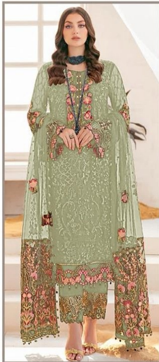
D.NO.53002 B 7