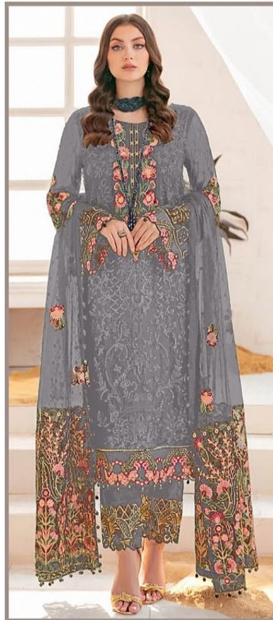
D.NO.53002 F 5