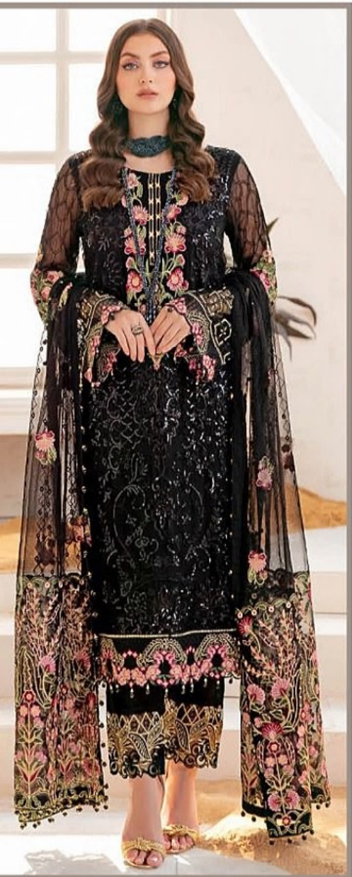
D.NO.53002 E 5