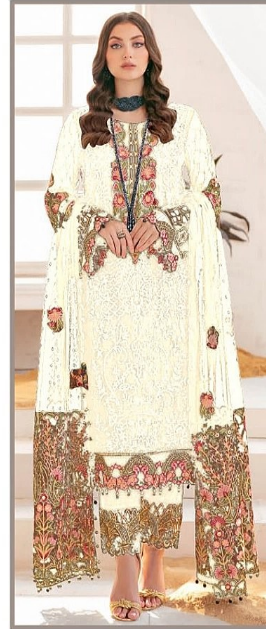
D.NO.53002 H 5