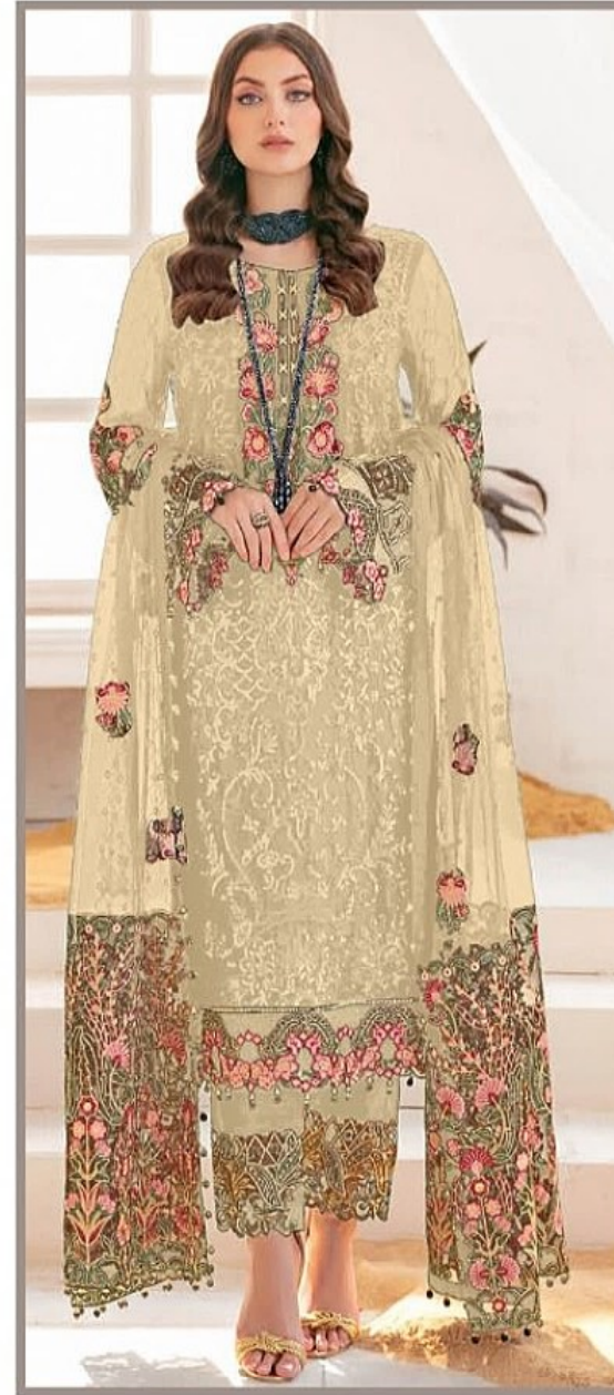
D.NO.53002 G 5