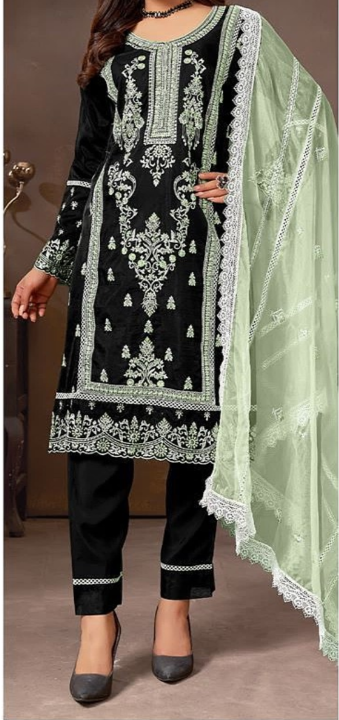
C - 1617 A