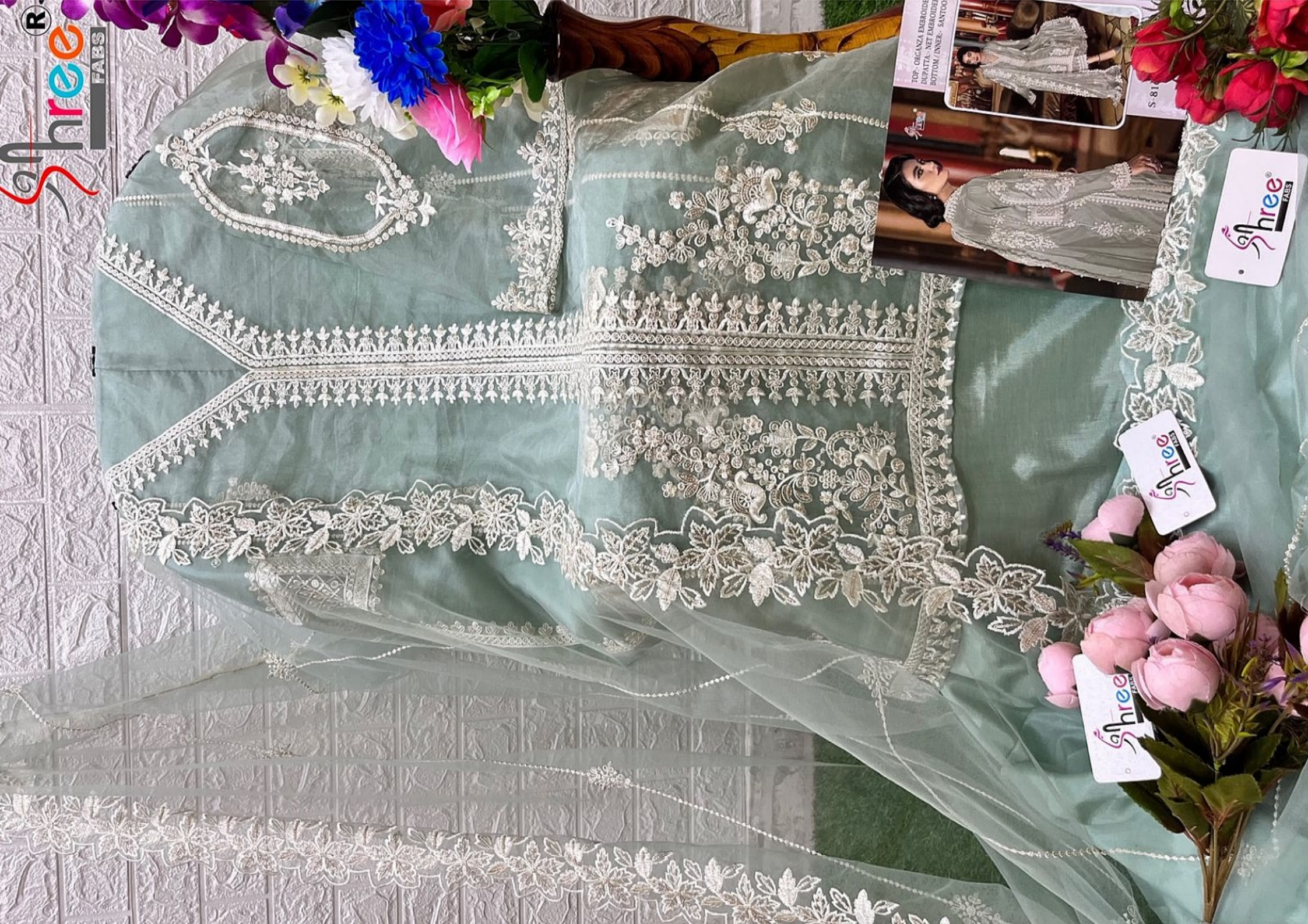
TOP: ORGANZA EMBROIDERED DUPATTA - NET EMBROIDERED BOTTOM INNER: SANTOO