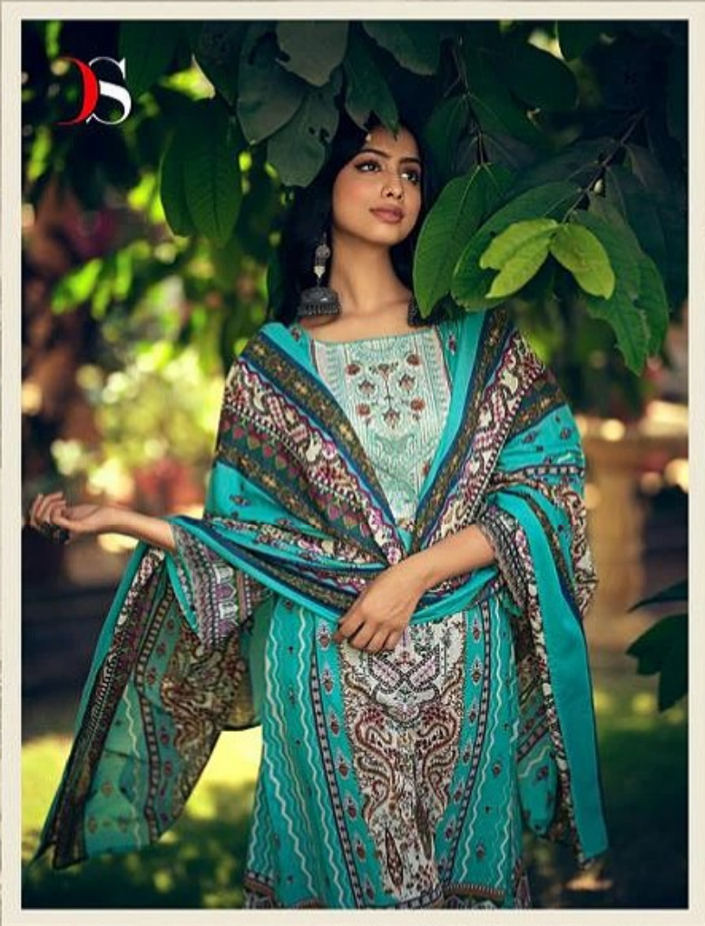
Contemporary geometric patterns