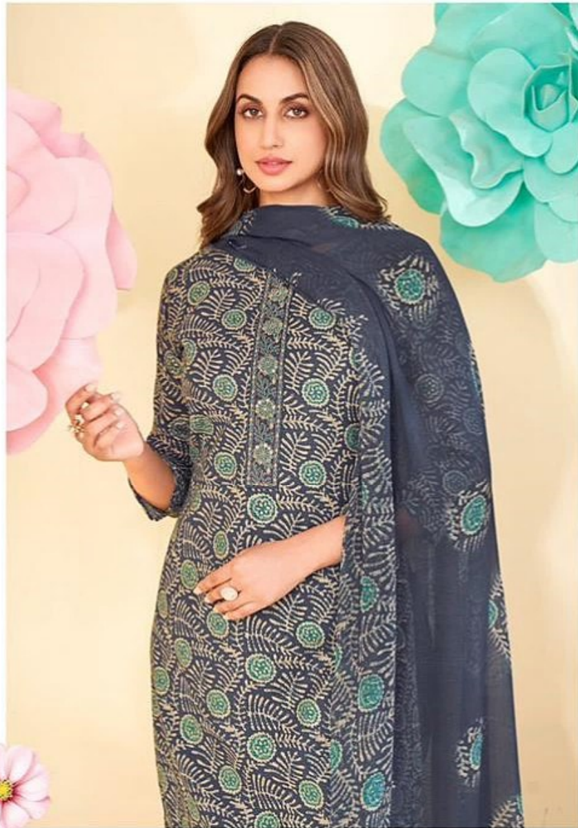
"A Floral Symphony in Every Fold."