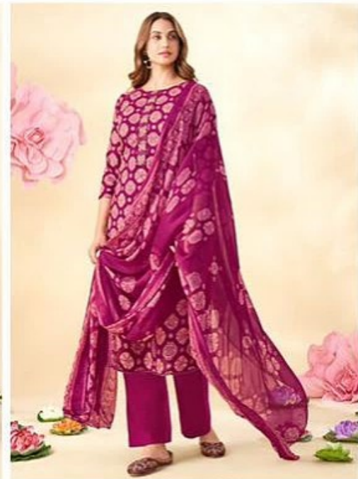
Code # 20008