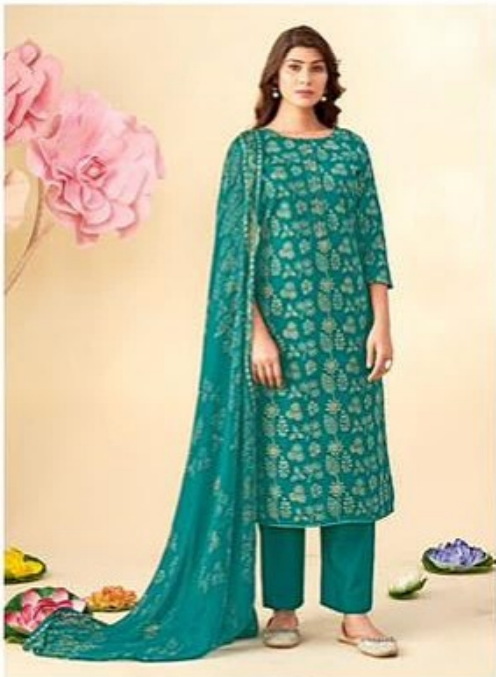
Code # 20007