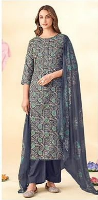
Code # 20002