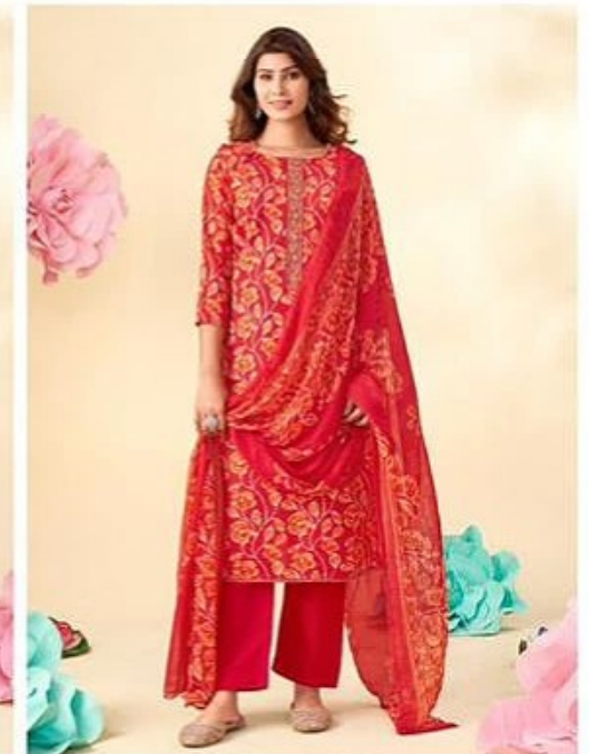
Code # 20010