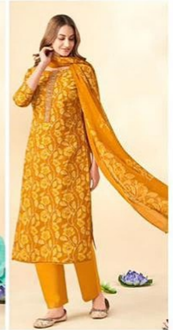
Code # 20006