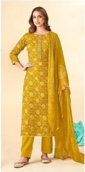
Code # 20001