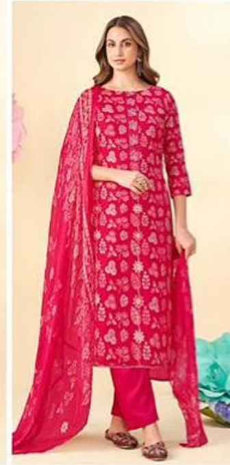
Code # 20005