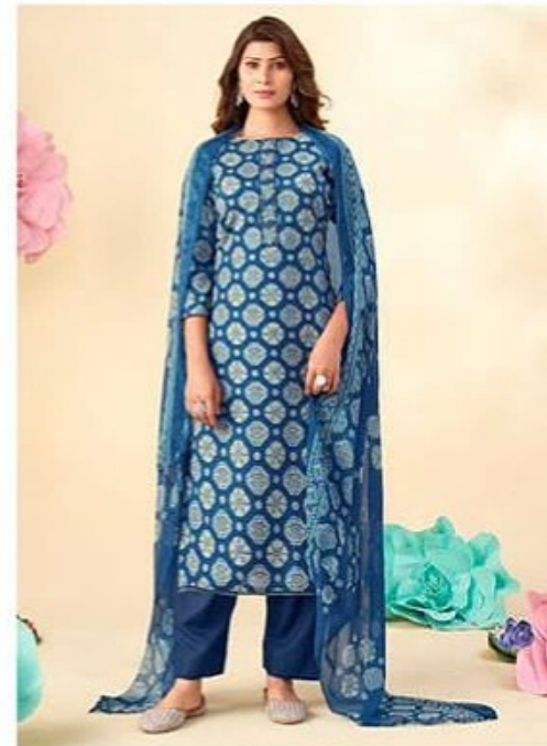
Code # 20009