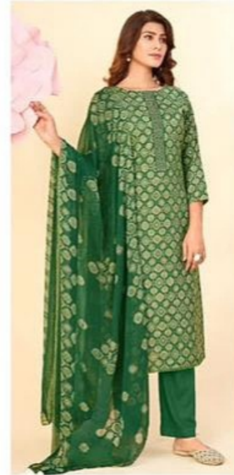
Code # 20004