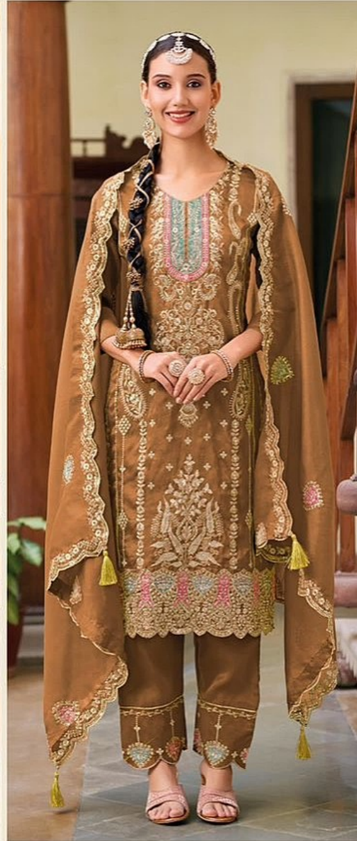
10041 - B