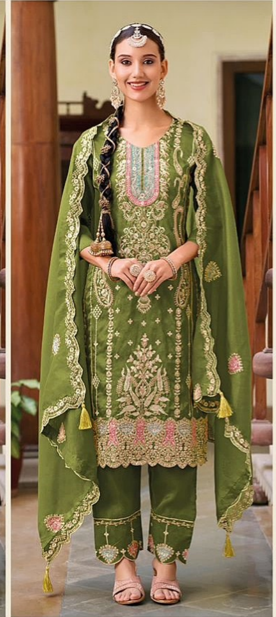
10041 - D