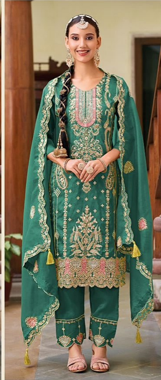
10041 - C