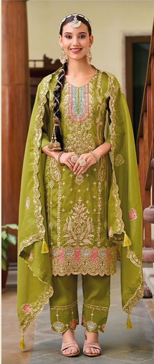
10041 - A