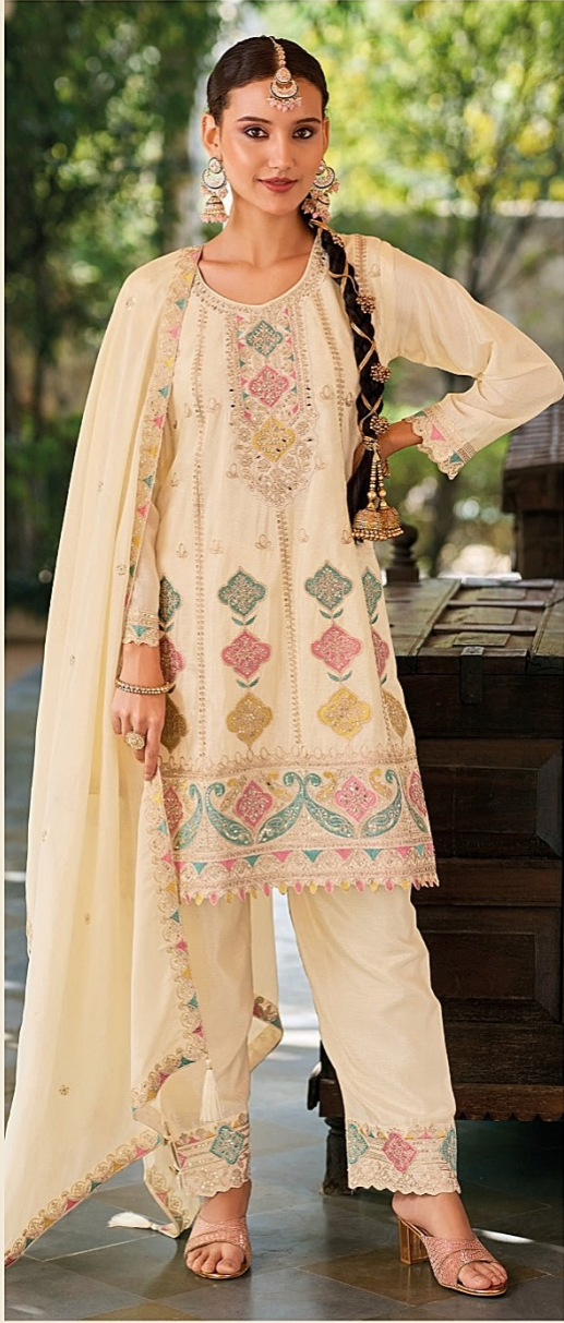
10081 - A