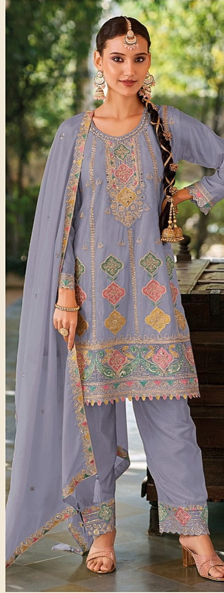
10081 - C