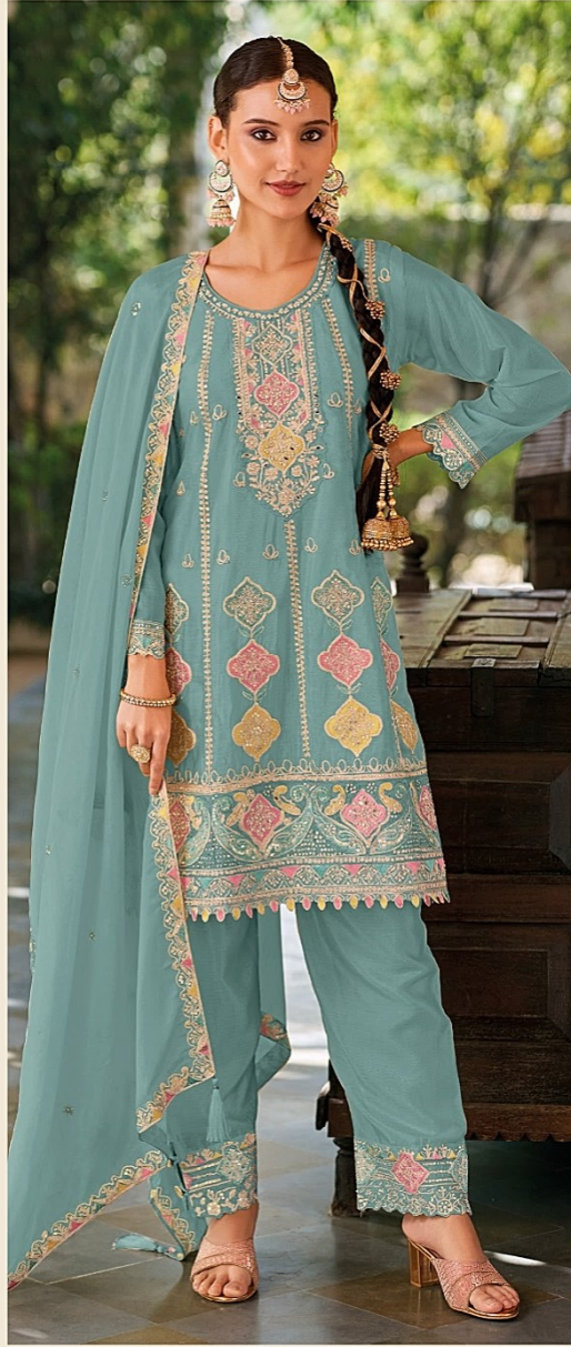
10081 - B