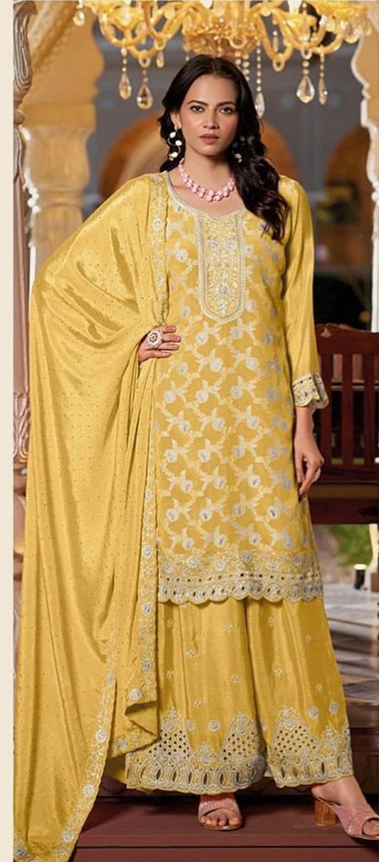
11081 - D