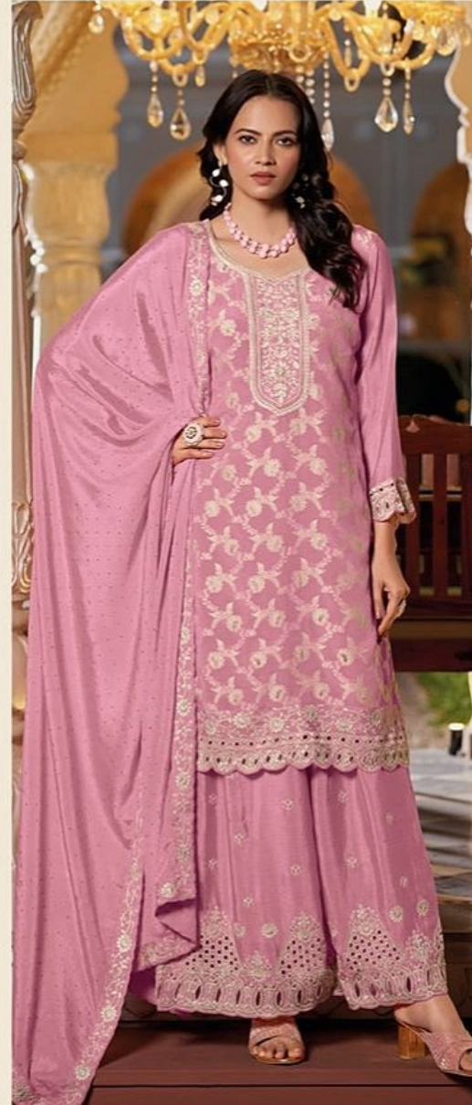
11081 - C