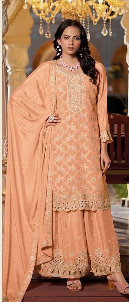
11081 - B