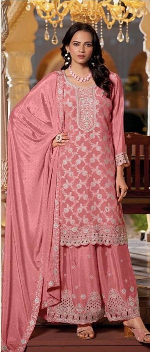
11081 - A