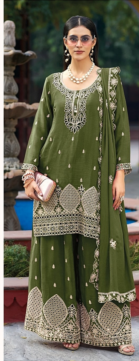
12011 - C