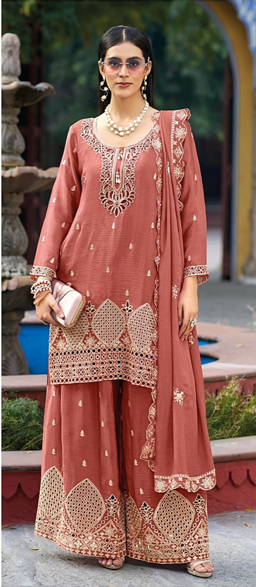
12011 - A