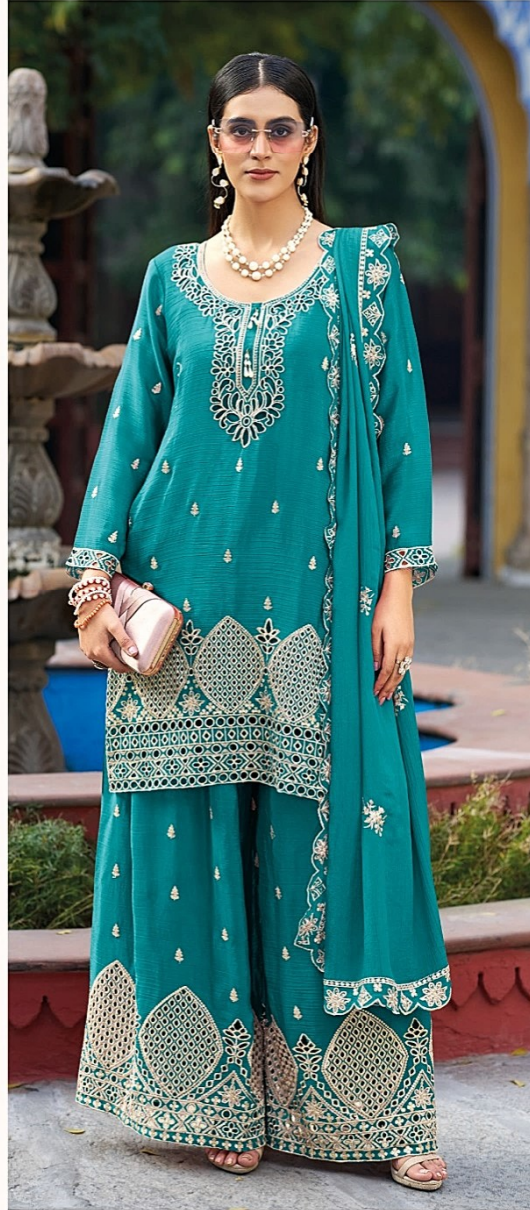
12011 - B