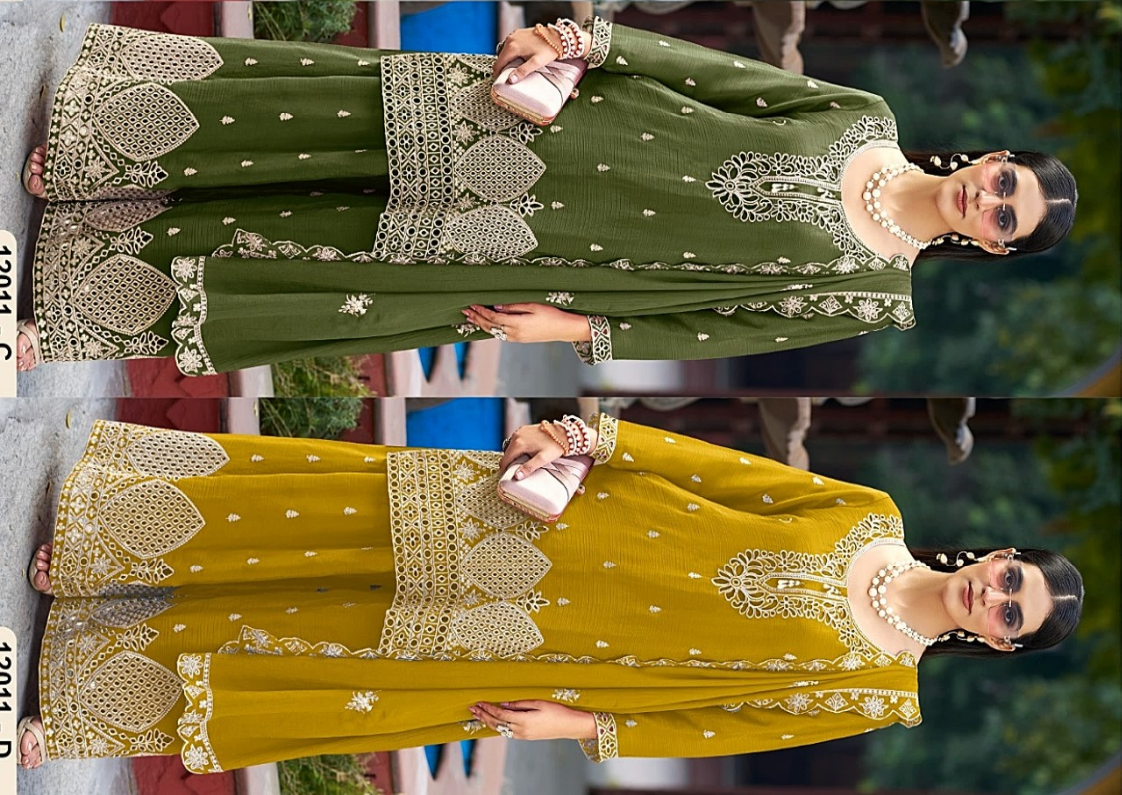
12011 - C