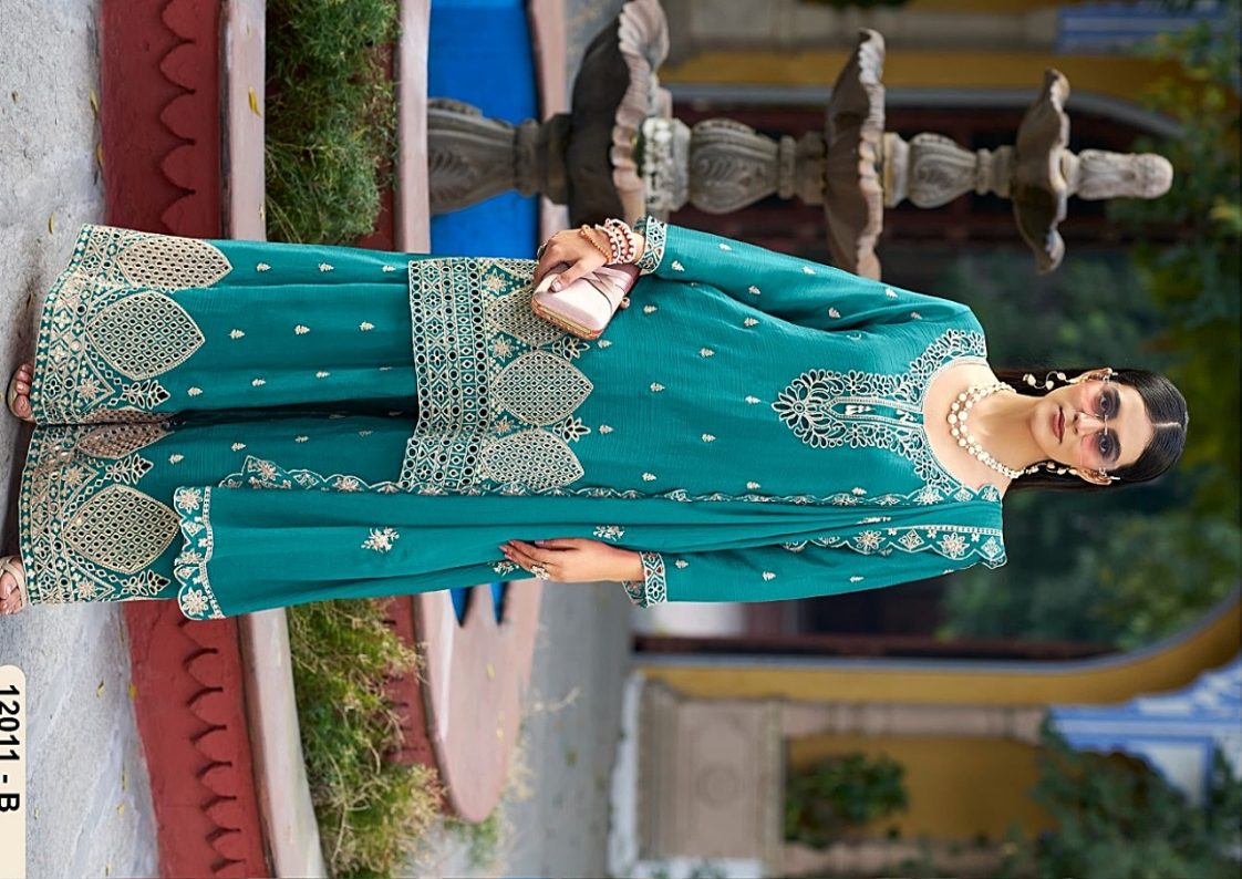
12011 - B