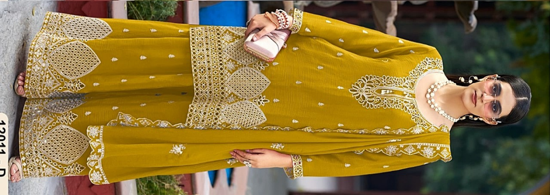
12011 - D