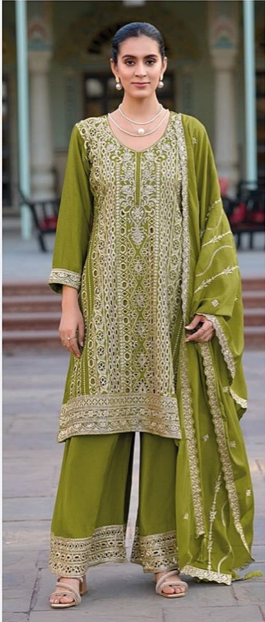
12051 - A