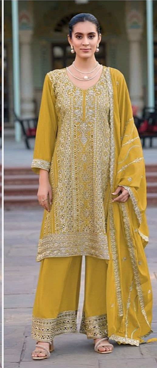
12051 - C