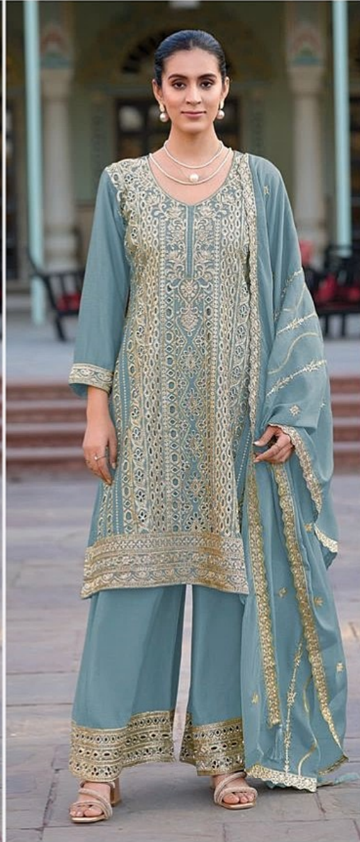
12051 - B