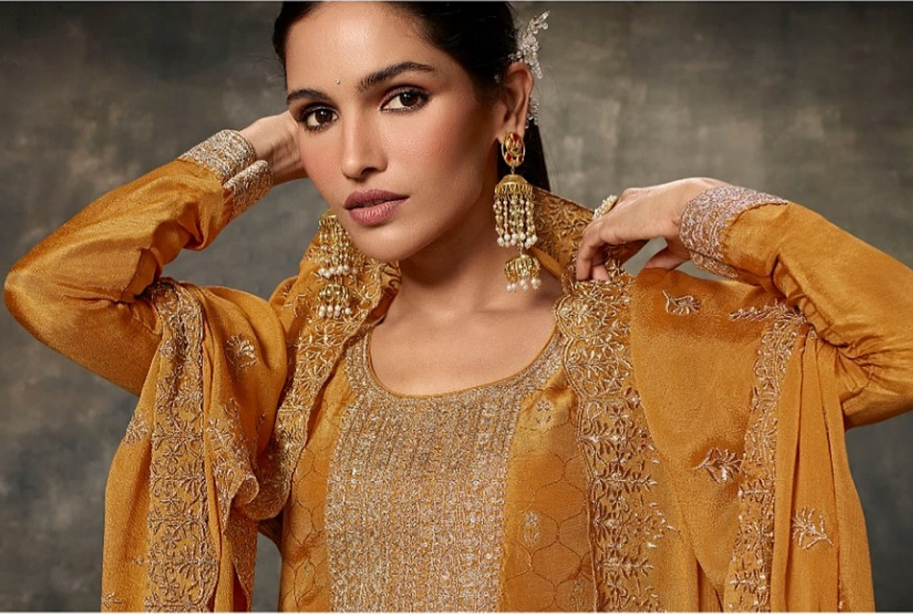
Get ready for summer festivities.