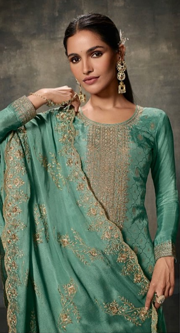
Embrace elegance and poise D.NO. 14871