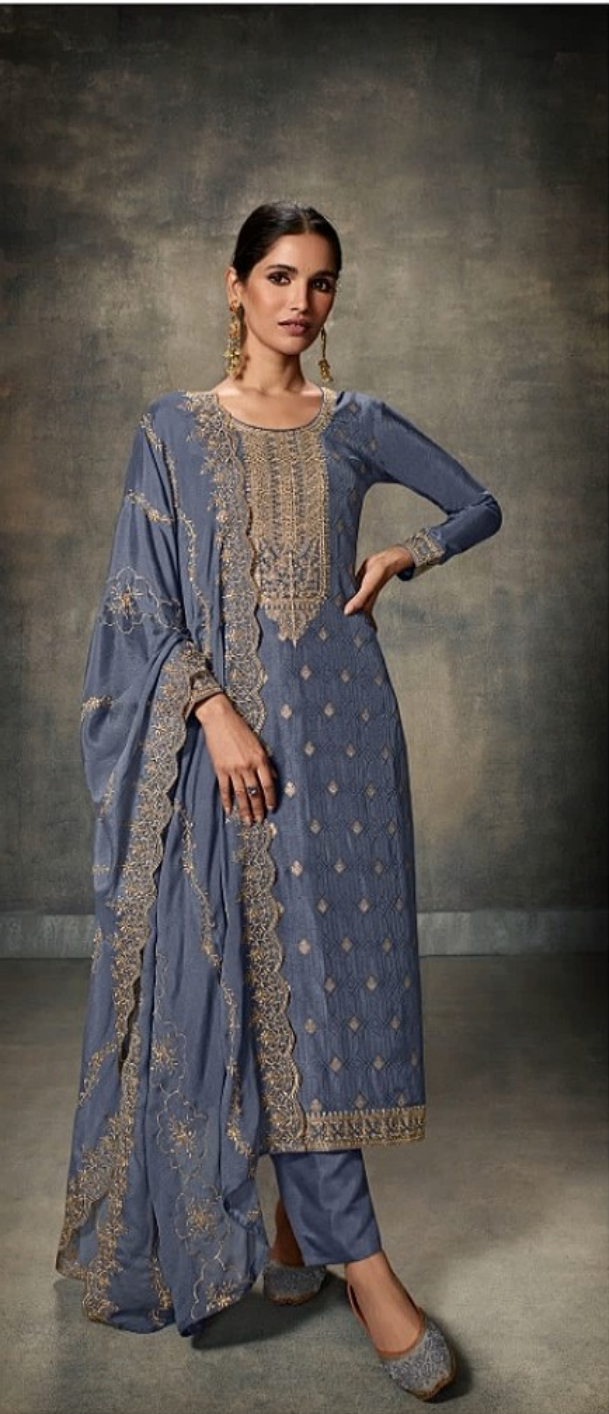
Brighten up your festive mood D.NO. 14873