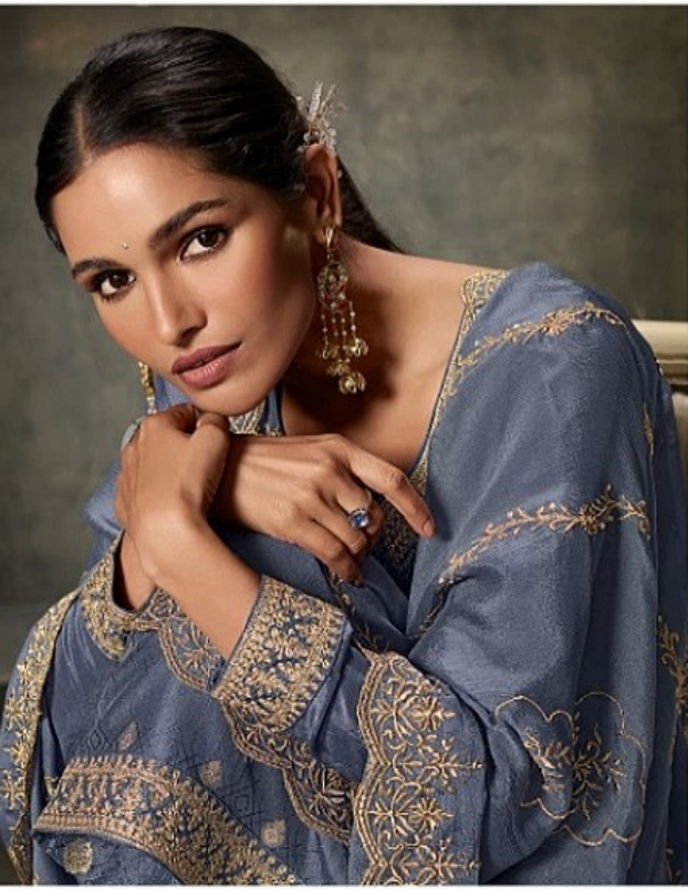
lighten up your festive mood D.NO.14873